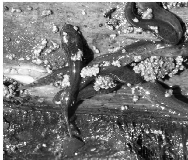
Figure 2: Several fish exposed when a galleried log was broken apart. A video showing a log from Big Pine Key, Florida, as it was being slowly “dissected” open is available in the online edition of the American Naturalist .

The first instance of this behavior was documented on the Belize Cays (Peter Douglas Cay), where in January 1991, we encountered a small drying pool (8 m × 3 m) in which at least four fish species (poeciliids/cyprinodontids) were stranded and dying (fig. 1A). We removed a 1.5-m-long log with a diameter of 9 cm from above the water line and on breaking it open discovered many K. marmoratus inside. The fish were packed heavily inside the galleried log, which remained quite moist in spite of being well above the water line. Fish were immediately active on being exposed, either flipping away from the log or attempting to enter deeper into the galleries. Ultimately, about 100 fish were collected from this log. During a sub-