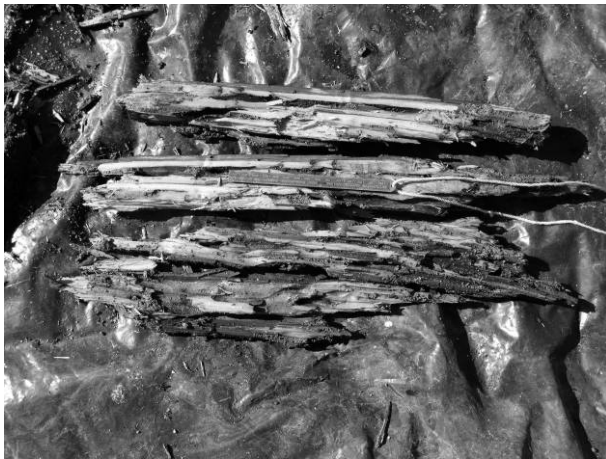
Figure 3: A galleried mangrove log broken up to expose the interior. Rule shown is 15 cm.

sequent visit to the site (February 2000), the pool was completely dry and an additional 13 fish were found inside a different 5-cm-diameter log (Taylor et al. 2004).