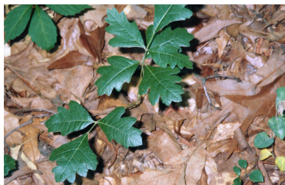
Poison Oak Leaf