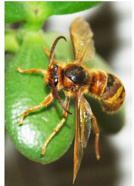
European hornet