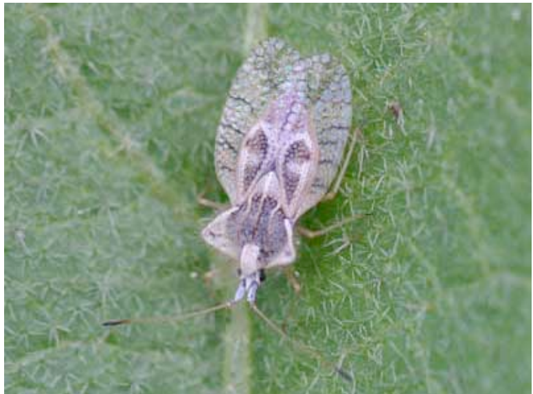
Eggplant lace bug.

CHEMICAL CONTROL: Treat with a registered insecticide when damage appears; repeat as needed.