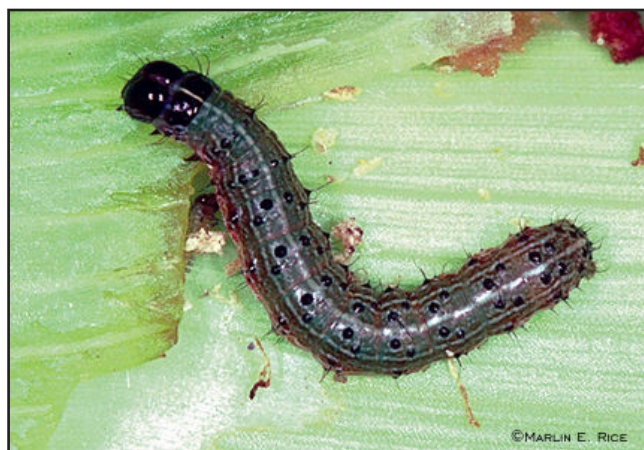
Fig. 1b. Early instar fall armyworm.