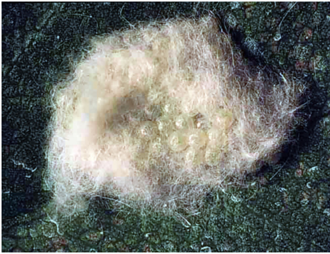
Fig. 2. Fall armyworm egg mass.

23 to 25 days. First instar larvae are able to produce a silken thread, which allows them to drop or be blown (called ballooning) to other areas. In Virginia, fall armyworms are most active in the late summer/fall (See Fig. 3), beginning in early July. Caterpillars can cause