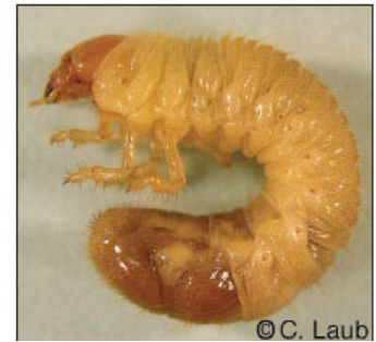
Figure 2. Immature stage

Milky spore disease may work in some areas but reported results have ranged from effective to no control.(see the latest ornament comments- it does not work) If it is applied, no insecticides can be used for 2-3 years afterward so enough Japanese beetles are present to allow the disease agent to build up.