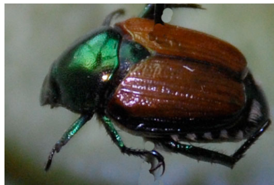
Figure 1. Adult Japanese Beetle (Eric R. Day)

Hosts: Japanese beetles feed on a wide variety of trees, shrubs, and herbaceous plants. They can severely damage the foliage for fruit trees and grapes and can at times be pest of vegetables and field crops. The immature stage, also called a grub or white grub can reach pest status on many varieties of grass grown for turf in Virginia.