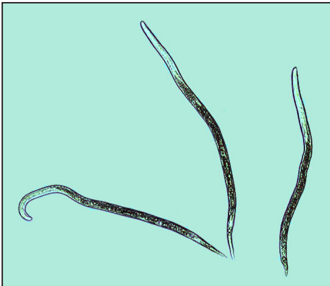
Fig. 2a. Second-stage juveniles of root-knot nematode, Meloidogyne sp.