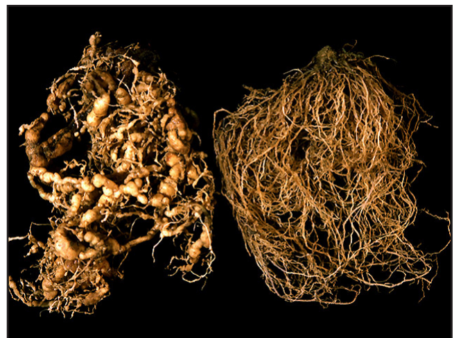
Fig. 3: Comparison between root-knot nematode infected root (left) and a non-infected root (right).

If nematode populations are high and growing conditions are good, damage may not be visible, but yield may be reduced. Severe damage is often visible and yield losses heavy if corn was stressed during the early part of the season. A fourth common species of root-