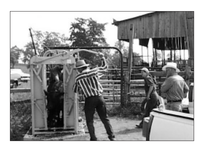
It is important for your veterinarian to be a part of the herd health team.

Herd health programs must be tailored to each individual production situation. Performance of procedures should be grouped because cattle handling is expensive, time consuming, and stressful In some cases, the cost of performing a procedure may outweigh the benefits gained. Every procedure should be evaluated in terms of its potential to be cost-beneficial. Veterinarians can be of tremendous help in establishing and maintaining health programs. They keep current with new developments in disease occurrence and in procedures available to prevent and treat diseases. Knowledge and experience enable them to help tailor programs that are based on the goals, capabilities, and situations present on given farms.