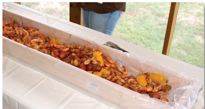
Simple, long food containers maintain sanitation, while coming close to preserving the traditional way of serving a boil.

The meal can be cleared from the table within 2 1/2 hours of serving, even if people eat at a very languid pace. By limiting the meal to this amount of time it is unlikely that a food safety issue will occur.