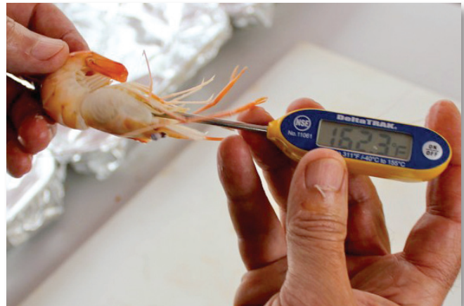
Shrimp proteins firm at approximately 160°F.

degrees Fahrenheit. At the actual boil, tongs were used to pull shrimp from the cooking water every 30 seconds for an internal temperature check. The shrimp were pulled from the water when the internal temperature reached the high 150s and placed in the insulated container. Temperature continued to rise into the 160s after the shrimp were pulled from the water. Shrimp may be held in the insulated containers for approximately 15 minutes before serving.