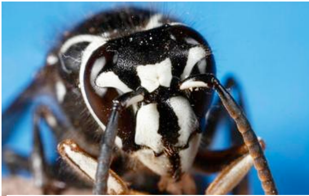
Baldfaced hornet, front view

DESCRIPTION: The baldfaced hornet is a large, black and white hornet up to 1 inch (25.4mm) in length. It is black and white in color with a mostly white head or “face”. It is widely distributed in Virginia. The nests are constructed of the same paper-like material as that of other wasps (yellowjackets). They differ a great deal from other wasp nests in being enclosed in a thick “paper” envelope. There is a single opening at the lower end of the nest and a few hornets always guard this. Nests are always abandoned at the end of the season.