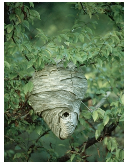
Baldfaced Hornet nest in tree