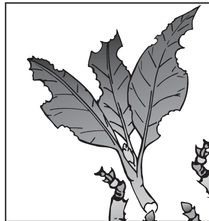
Japanese Weevil Damage

over several weeks or more. Presumably, they lay their eggs in the soil during midsummer and the larvae feed on plant roots until late the following spring. Adults cannot fly since the wing covers are fused together. There is one generation per year. Overwintering is done by larvae in the ground.