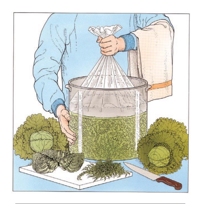
Figure 4. Weighting sauerkraut with foodgrade plastic bag and plate. (Adapted from USDA 2009)

A suitable sized clean plate or glass pie plate can also be placed on top of the vegetables inside the fermentation container. The plate must be slightly smaller than the container opening, yet large enough to cover most of the vegetables. The plate can be weighted down with 2-3 sealed quart jars filled with drinkable water or heavy-duty plastic food bags filled with a brine solution. solution is recommended in plastic bags to assure that the fermentation brine is not diluted should the bag leak or break. The brine can be made by mixing 4 1/2 tablespoons of salt for every 3-quarts of drinkable water. Covering the fermentation container opening with a clean, heavy bath towel or lid helps prevent contamination from insects and molds while the vegetables are fermenting.