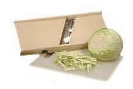
Figure 6. Kraut Cutter or Kraut Board