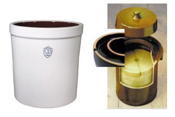
Figure 2. Examples of a simple cylindrical ceramic crock (left) and a specialized fermentation crock (right).

removed or disrupted which may be difficult for curious cooks.