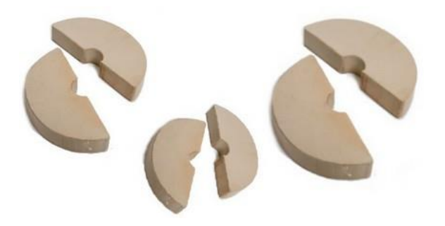
Figure 3. Ceramic Fermentation Weights

weights that are not intended for food use as they may contain harmful compounds such as lead. Rocks should never be used as weights because they may contain heavy metals and limestone that can degrade under salty and acidic environments and can become part of the food.