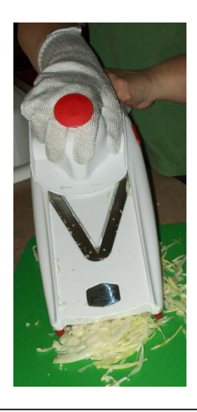
Figure 5. Mandolin. User is wearing a cut resistant glove.