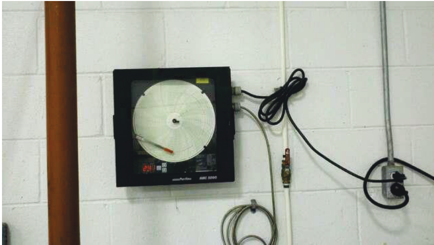
One of the “Time and Temperature Recorders” attached to the retorts in the Hillsville, Va. Community Cannery.