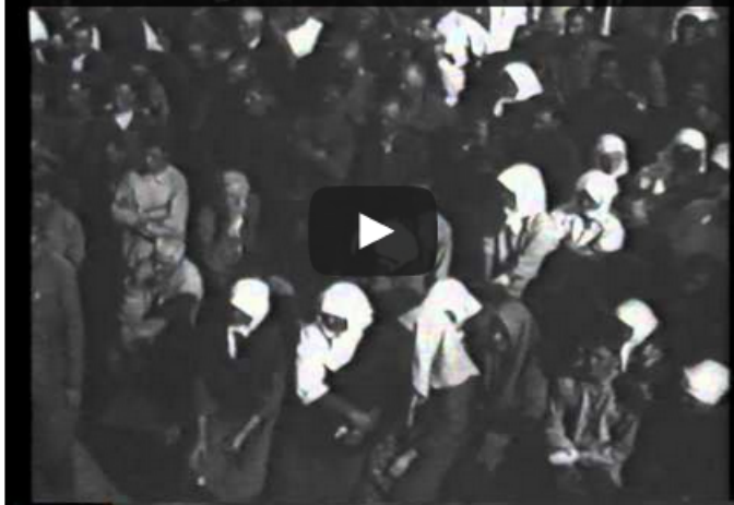
Confiscations in a Cossack Village (1929)