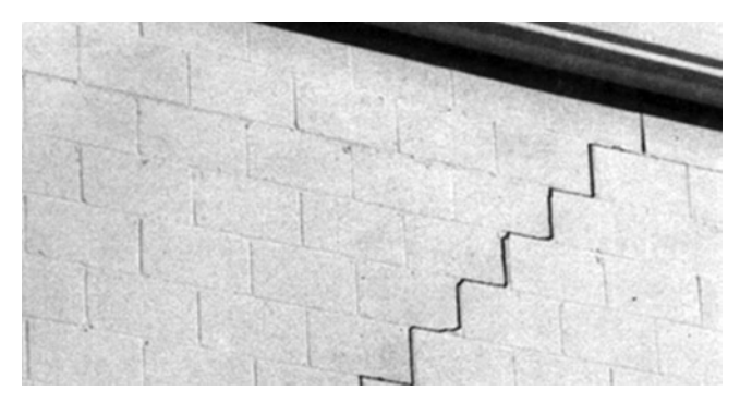
Figure 2. Settlement cracks in a masonry wall that has been subjected to angular distortion due to differential settlement.

appear in plaster and masonry (figure 2), door and window openings become distorted, and ultimately, the integrity of the structure can be threatened. Damaging distortion also occurs as simple lateral strain in which the horizontal distance between a building's corners changes, generally increasing, leading to the opening of joints and cracks. Lateral strain is also associated with settlement, especially deep-seated settlement, and may comprise a significant part of the total structural distortion.