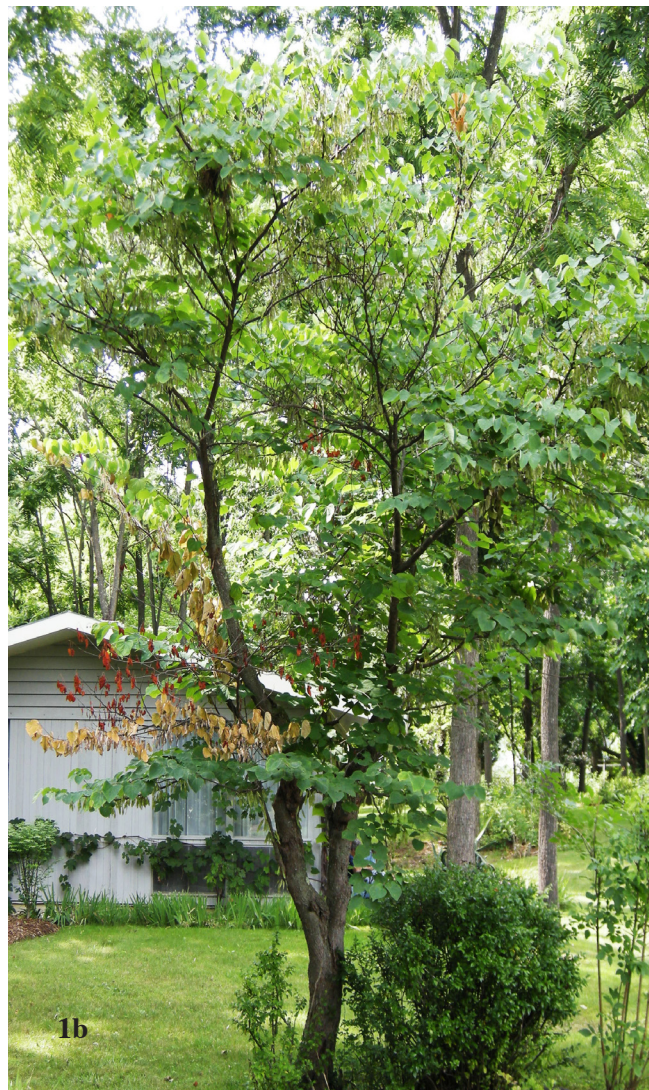
Figures 1a and 1b. Symptoms of Botryosphaeria dieback on rhododendron and redbud.