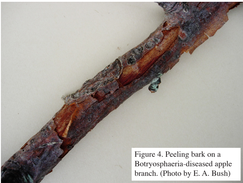
Figure 4. Peeling bark on a Botryosphaeria -diseased apple branch.

back occur. However, if bark is removed, the wood beneath the bark will be discolored brown to reddish-brown instead of white (fig. 2). In some cases, cankers may appear sunken and/or darkened (fig. 3) or be surrounded and contained by callused wound wood, particularly on larger branches or trunks. In other cases, bark may peel and drop from cankered areas (fig. 4).