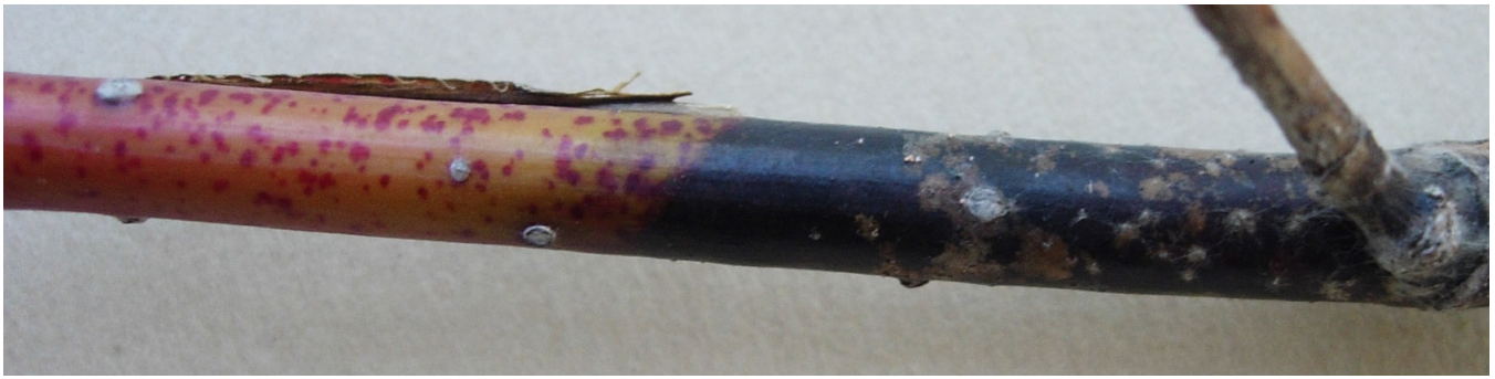
Figure 5. A Botryosphaeria canker (discolored tissue) on a smooth-barked bloodtwig dogwood.