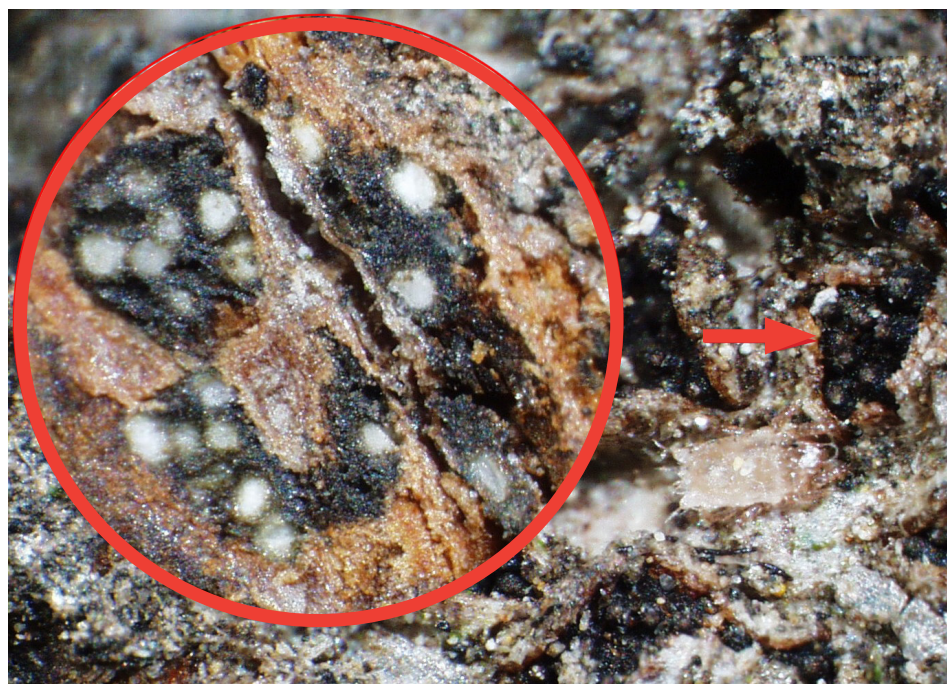
Figure 7. A magnified view of black fruiting bodies (pycnidia) [arrow] of Botryosphaeria species erupting through the bark of a Botryosphaeria -diseased photinia branch. The fruiting bodies are white inside when sliced open (circular inset).