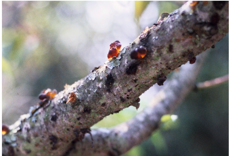
Figure 6. Gum exudation (gummosis) on a Botryosphaeria -diseased peach branch.