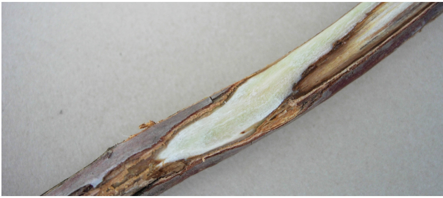
Figure 2. A wilting rhododendron branch with the bark partially removed to reveal the brown discoloration in the wood caused by Botryosphaeria species.