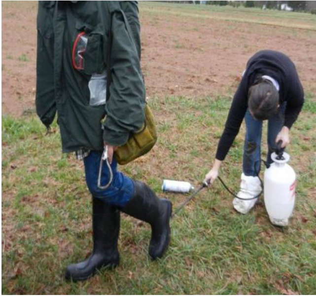
Figure 6: Clean and sanitize boots between hoop houses and production fields.