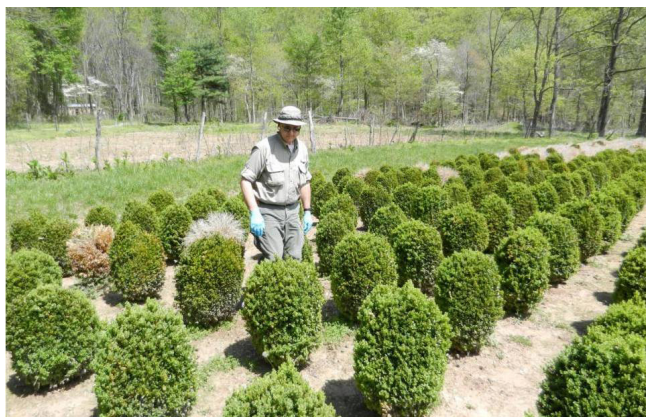
Figure 8: Scout host plants frequently.