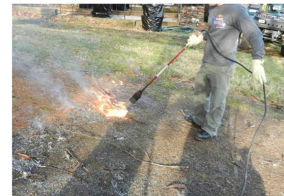
Figure 2: Residual leaf debris can be eradicated by burning with an agricultural flamer.