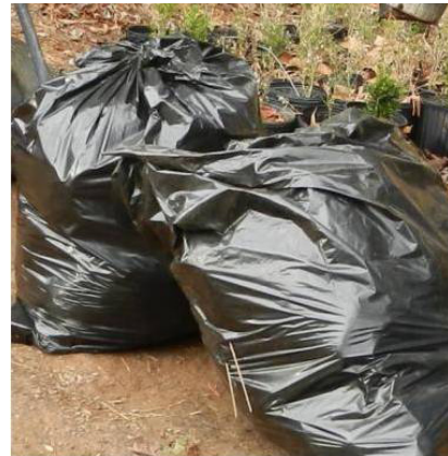
Figure 1: Infected plants should be bagged to contain leaf debris.

II. Suspend use of all fungicides during the quarantine period.