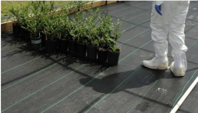
Figure 5: Store plants on easy-to-clean surface such as weed mat over well drained gravel.