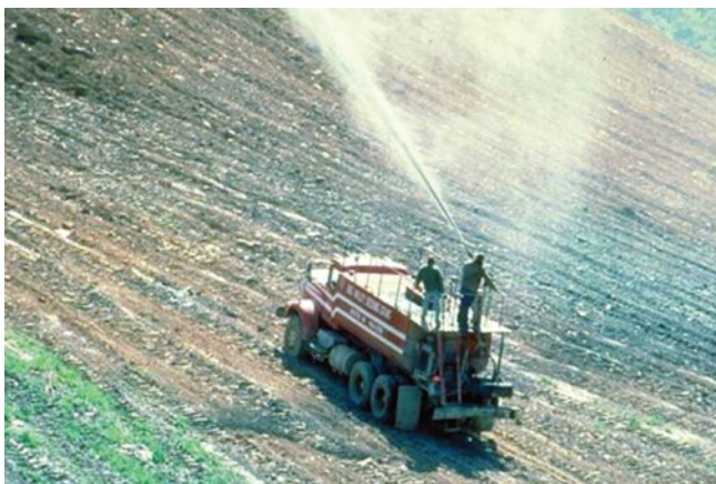
Figure 5. A hydroseeder applying seed in a fertilizer slurry while revegetating a surface coal mine.

In central Appalachia, surface mining generally requires reclamation of steep slopes. The most common technique for seeding and applying amendments is through a hydroseeder (figure 5). Fertilizer, lime, mulch, and seed are normally mixed with water in the hydroseeder tank. Commercial cellulose mulch is typically included in the mix at rates of 1,000-1,500 pounds per acre. This material improves seed germination during dry weather and aids the hydroseeding process by marking seeded areas. Procedures for adding a legume inoculant and assuring survival of that inoculant in the hydroseeded slurry are discussed above. Fertilizer rates are discussed in VCE publication 460-121.