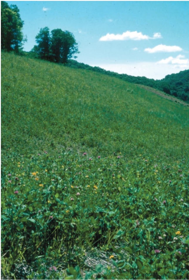
Figure 6. A pasture on a reclaimed mine site in northern West Virginia that was established using several grass and legume species, as described in this publication.