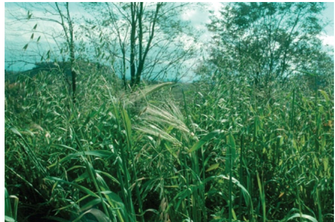
Figure 1. Fast-growing annual grasses, most of which are annuals, are often seeded as “nurse crops” to protect the perennial grasses and legumes that are generally slower to establish. These fast-growing annuals also provide organic matter to the soil as they decompose after dying off.

Fast-growing annual species (such as oats or millet) may be included in reclamation seed mixes as companions to perennial grasses and forbs. These fast-growing annuals are often called “nurse crops” because they provide protection for the perennial species that are