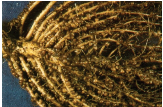
Figure 3. Nodules formed by Rhizobium bacteria on the roots of several legume species. When nodules are present, legumes can “fix” nitrogen from the air, satisfying their own nitrogen nutrition requirements and providing excess nitrogen to nonlegume plant species.

A few of the more important legumes are described in more detail below.