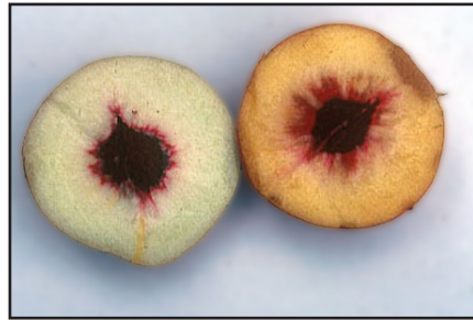
On the left is 'Lady Nancy', a white flesh peach with a yellow line following the suture; on the right is a yellow flesh peach.