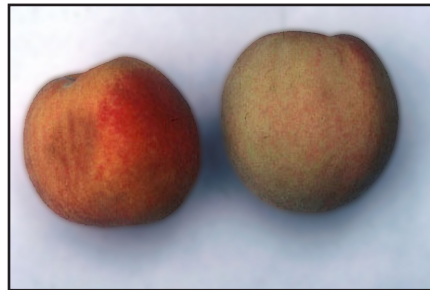
On the left is a yellow peach with yellow ground color. On the right is a white peach with whitish green ground color.