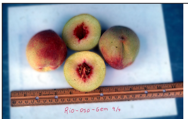
The variety is 'Rio-Oso-Gem'. The fruit on the right shows a lopsided suture.

Rich May - A recent introduction from Zaiger Genetics, Modesto, CA. Trees often produce few blossoms and cold hardiness is questionable. Trees usually produce light crops that rarely need thinning. Harvest season begins from June 19 to June 28. Fruit are round and large (2.5 to 2.75 inches in diameter) for an early variety, and there is little pubescence. Seventy to 95%