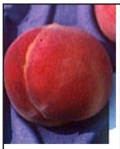
The variety is 'Cresthaven'. This fruit has a fairly deep suture.