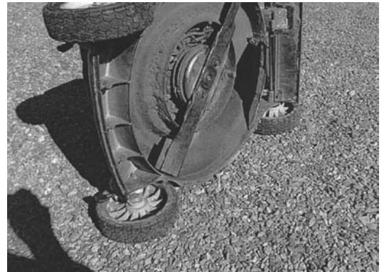
Close-up view of mower blade modification on back edges opposite sharpened blade edges.

A final note on recycling the mulch film, the strip fumigation, the beds, the labor of planting, and the drip irrigation tubing/headers: Successful strawberry carry-over fields may also be recycled yet again for a third cropping cycle, by planting fall vegetables on the mulch film after the second berry crop. In both cases, whether after one or two strawberry cropping cycles, soil testing and fertigations for subsequent crops needs to be done according to the particular crop needs and timing for nutrients. These rates and timings are shown as sidedress rates and timings in VCE Pub. 456-420, Vegetable Production Guide for Virginia. We have found that the sidedress rates given in the publication for broadcast, full acre application, may be cut by one-half since you are fertigating only about one-half the acre, only the portion within the beds beneath the mulch film. By the end of a third cropping cycle, the mulch film has begun to break into pieces due to photo-degradation from sunlight. Ultraviolet (UV) inhibitor compounds are maximized in thicker films such as 1.25 to 1.50 mils thickness and greater, affording even longer recycling potentials. The drip tubes and beds are usually still intact after 3 cropping cycles; fertigation can be used to re-charge beds with needed nutrients for subsequent crops.