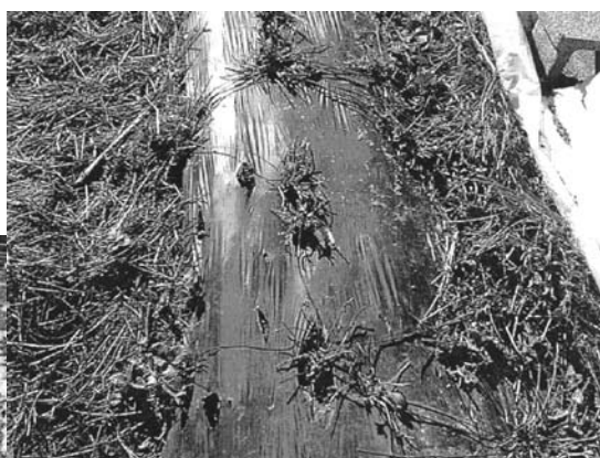
Close-up view of mowed bed showing old runners and leaf growth has been lifted, cut and removed, late February (crop cover is shown on left)