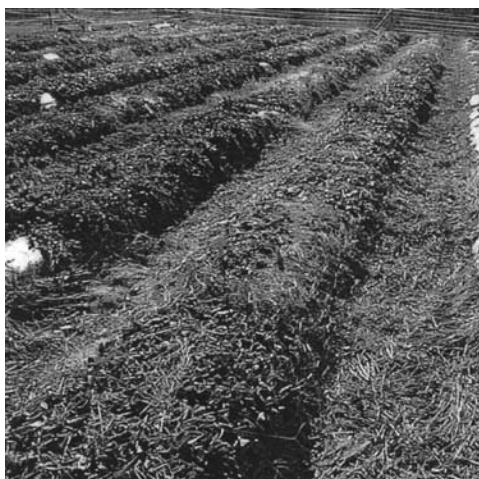
Second year carry-over beds before mechanical mowers cleaning (right) and after mowing (far right) in late February