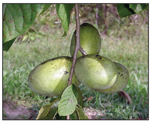
Figure 16. Fly speck and sooty blotch on pawpaw fruit.

Currently, with limited or no registered chemical options for pest control in pawpaw, cultural methods and "organic" pest control products are the primary option for both insect and disease management.