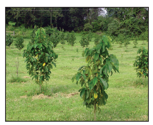
Figure 9. New pawpaw orchard in northern Virginia. Four-year-old planting is shown.

Commercialization of biomass production for drug or pesticide uses is expensive and may be an unrealistic expectation. Corporate investment for research and development of a new drug or pesticide product is expensive due to government approval requirements, and the market potential is a driving factor in decisions to develop a product.