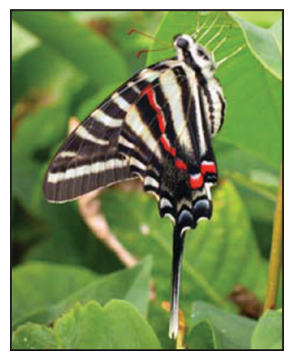
Figure 6a. Zebra swallowtail butterfly adult on pawpaw.

Nursery trade development for orchard and edible landscape plantings is on the increase. Currently in the U.S. there are over 40 nurseries selling pawpaw trees, and in the past several years, at a brisk pace. Named cultivars are offered as grafted trees along with non-grafted seedlings. Grafted trees are expensive and retail for $18.00 to $25.00 each. As a landscape tree, the pawpaw has attractive form, size, and fall color, as well as potential fruit production. It also attracts the zebra swallowtail butterfly ( Eurytides marcellus ), whose larvae feed exclusively on pawpaw, but do minimal damage (Figures 6a,b).