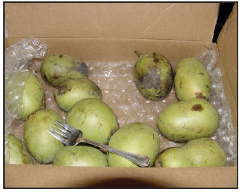
Figure 7. Pawpaw fruit bruise easily and should be handled gently and packed with care; note use of bubble wrap to protect fruit in box.

Pawpaws, once ripe, are very perishable, soft, and bruise easily, presenting problems for marketing. Though they can be picked at a less than ripe, but mature stage, best flavor intensity and sweetness is achieved when fruit is allowed to tree-ripen, but not over-ripen. Pawpaw fruit are climacteric, which means there is a rapid increase in respiration and ethylene production during final fruit ripening, causing fruit to quickly become over-ripe. This may preclude storage with other fruits sensitive to high levels of ethylene. When completely ripe, pawpaws will last for about two days at room temperature, or about a week under refrigeration (40° to 45°F degrees). Fruit harvested immature will not ripen, even if treated with ethephon, a common fruit ripening material that releases ethylene gas. However, if the fruits are picked before fully ripe, but mature, they can be refrigerated for two to three weeks, and will subsequently ripen at room temperature over several days. As the fruit ripens, it quickly develops handling bruises, blotches, streaks, and freckles, much like an over-ripe banana, which can reduce its freshmarket appeal. Some fresh marketers have used bubble wrap in boxes to minimize damage during transport (Figure 7). Research is needed in postharvest handling of fruit.