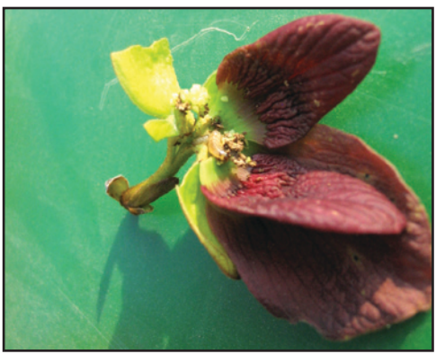
Figure 15. Peduncle borer damage of pawpaw flowers.

Pawpaws have few noted pest concerns. The peduncle borer ( Talponia plummeriana ) is a caterpillar pest that can bore into the pawpaw flower and cause it to drop (Figure 15). Though this damage is minor, in certain years the borer can destroy many flowers. Its presence should be monitored. Earwigs, slugs, San Jose scale, leaf rollers, and tent caterpillars have also been reported as occasional pests. Deer are not known to readily eat twigs or foliage, but bucks will use young trees to rub velvet from antlers in the fall. Other potential mammalian problems include squirrels, raccoons, opossums, and foxes which prefer the ripe fruit and as with other fruit trees, voles and mice may cause bark or tunneling damage, particularly when mulch is used around the trees for weed control.