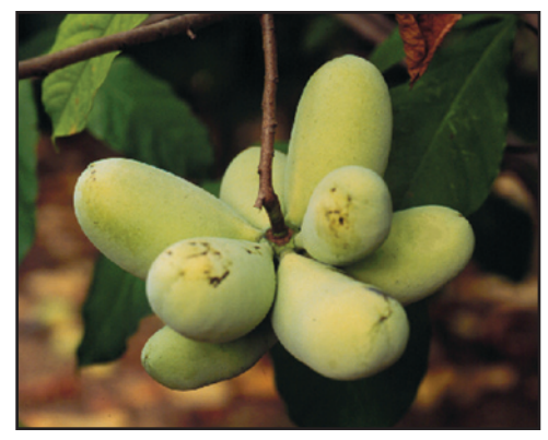
Figure 3b. Pawpaw exhibiting typical clustered fruit set.