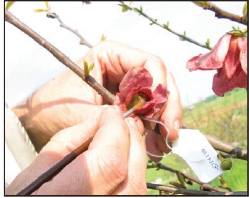
Figure 13b. Hand pollination of pawpaw flowers using artist's paintbrush to distribute pollen.