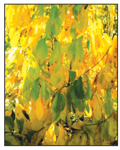
Figure 2. The bright yellow fall foliage color of pawpaw makes it desirable as an ornamental species.