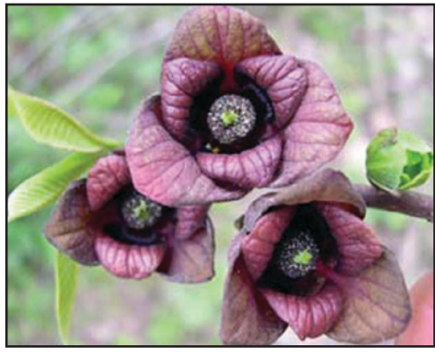
Figure 13a. Pawpaw flowers at maturity, note bright green stigma in center of flower, delayed development of the flower to the right, and the stage of leaf development.

Grafted trees may develop flowers as soon as the third season. Depending on vigor of the trees, a few fruit may be left on in years three and four. As noted, pollination may be difficult to achieve due to self-incompatibility and lack of pollinators. Various flies and beetles are attracted to the smell of the flowers and they are likely the primary pollinators. Honeybees do not prefer the flowers. Though carrion placement may attract fly and beetle pollinators to the area, simple hand pollination with an artist's paintbrush works well in small orchard situations to ensure fruit set (Figure 13a, b). Use the brush to transfer pollen grains from the anthers of one cultivar to the receptive stigma of another cultivar. Pollen is ripe when the anthers are brown, loose, and crumbly and the pollen comes off on the brush as a yellow dust. Stigmas are ripe when the tips of the pistils are green and glossy and the anther ball in the same flower is still hard and green. Using this method,