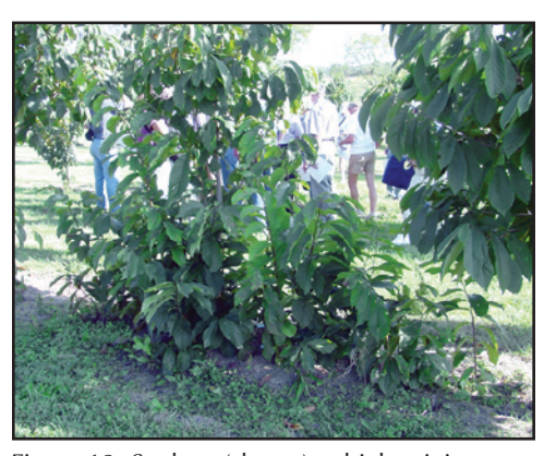
Figure 12. Suckers (shoots), which originate from the rootstock, developing near the base of an older pawpaw tree.

Like peaches, proper pruning and adequate fertility are needed to keep trees vigorous and producing many annual shoots. Currently, a central leader tree is recommended, with topping at about 15 feet to control height. Suckering (shoot development) from the roots or tree base may occur with some cultivar and rootstock combinations and these should be pruned (Figure 12). The canopy may require thinning to maintain good air movement and light penetration. Annual nitrogen (N) fertilizer requirements for bearing trees are at best an estimate. However, sparse root structure and high foliage densities would indicate that moderate rates of at least 40 to 60+ pounds of N per acre may be needed, with a split timing of the total rate between early spring and after fruit set. Should no crop set, the second application may not be needed. Site fertility, tree age, crop loads, and vigor will affect nitrogen application rates, and much research work needs to be done to characterize proper crop nutrition.