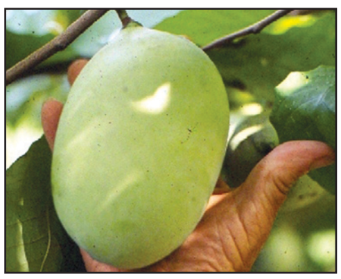
Figure 3a. Large, single-set pawpaw fruit.