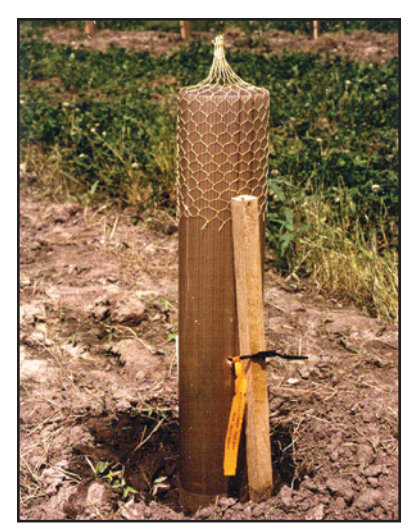
Figure 11. Tree shelters provide protection from direct sunlight during the first year.

Information on the care of established trees in an orchard setting is limited and based on educated assumptions. Fruit are borne on the previous year's wood.