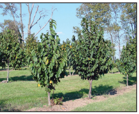
Figure 1. Pawpaws in orchard setting, note pyramidal form.

Historically, pawpaw was a well-known and much utilized fruit in the eastern U.S. It was an important food crop for both Native Americans and early settlers. Today it is a local specialty, gathered in the wild by enthusiasts and grown by hobbyists in backyard orchards.