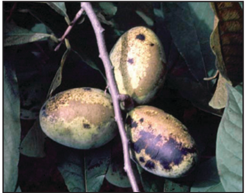
Figure 14. Typical sunburn damage on pawpaw fruit.

fruit set can be heavy and care should be taken not to over-load and stress the tree. Excessive fruit may need to be thinned by hand. Fruit that develop in direct sunlight may become sunburned (Figure 14), and should be thinned first.