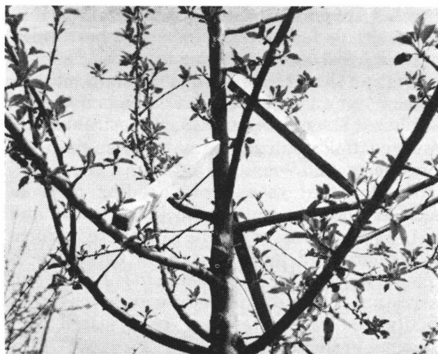
Figure 1 — A young apple tree with limb spreaders in position

Limb spreaders may be used to aid in the establishment of a strong framework of scaffolds and encourage earlier production. They are especially useful in training varieties like Red Delicious that have a tendency to form branches with narrow angles, growing more upright than spreading. Steel wire of about 1/8" diameter or wooden strips with finishing nails in each end are inserted between the selected scaffold limb and the main stem of the tree, thereby spreading the limb to