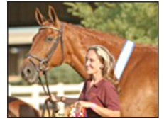
Being clean can win awards!

Proper grooming and keeping horses clean involves not only using the right tools but also behaving safely around the horse.