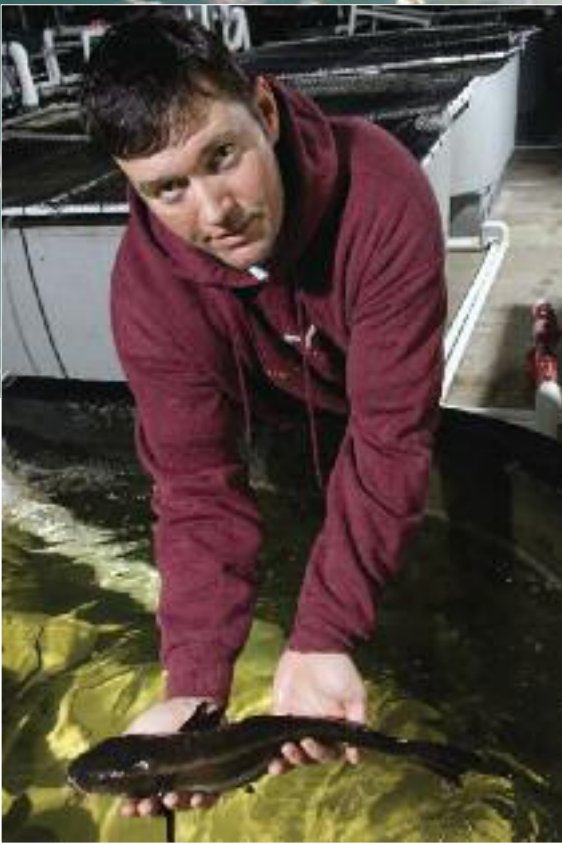
The cobia is the aquaculture center's main focus of research.