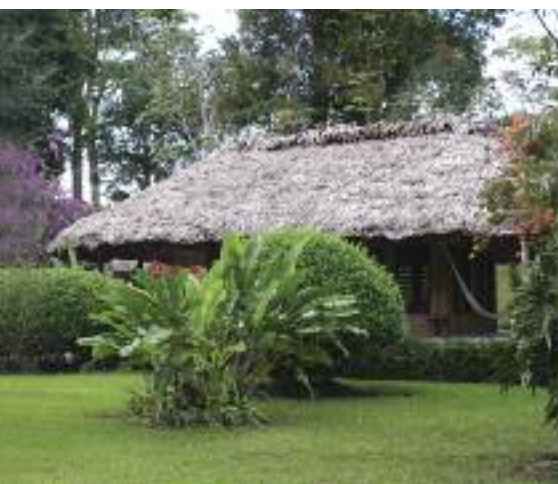
Guests stayed in cabanas.

Note: Plans are being made for next year's trip to Belize. Please watch for dates and details in the coming issues of the CNR newsmagazine.