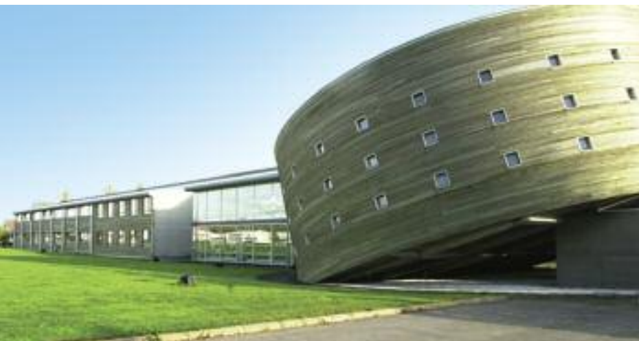
The School of Wood Science and Engineering of the University of Nancy.