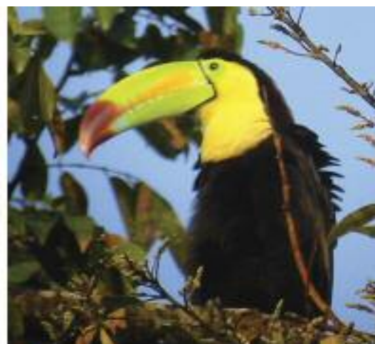
A keel-billed toucan, the national bird of Belize.