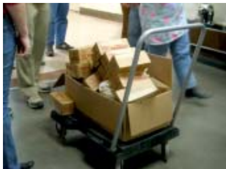
MEPS members escort loads of pennies to be counted for the Penny Wars

ond place went to AOE with only 6,068 points. Money raised in the competition is combined with a matching contribution by SEC of up to $500, donated to the winning department's chosen charity. MEPS has begun a tradition of donating their winnings to fund scholarships in the MSE department. ❖