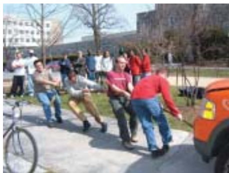
Page 10 Exploring Materials, Spring 2006

MEPS members were enthusiastic participants in the events and finished in the top three in several events. Thanks to the year-long support and participation of the entire MSE department, MEPS finished way ahead of the competition in the Penny Wars with 90,413 points. Sec-