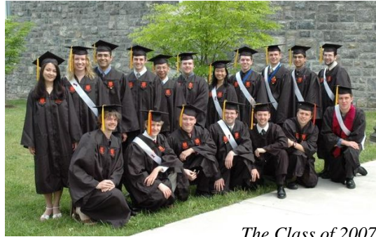
The Class of 2007