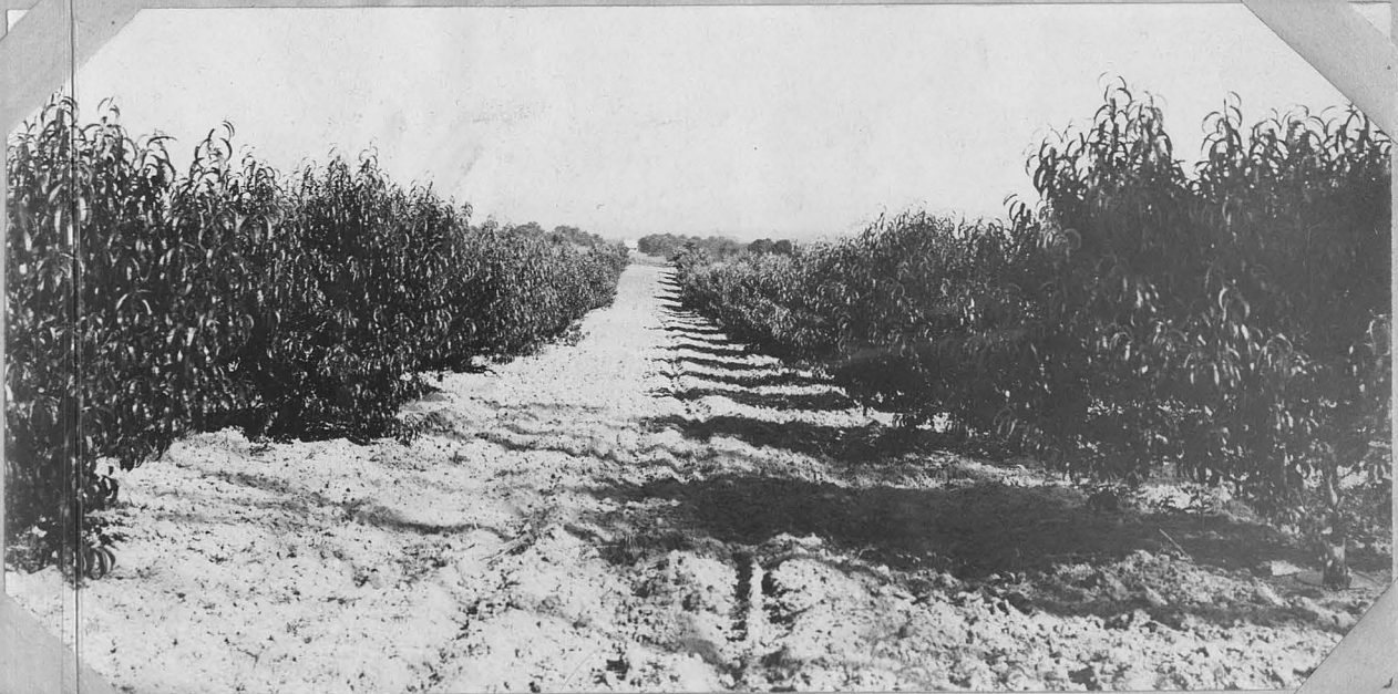
THE CROZET STATION PEACH ORCHARD