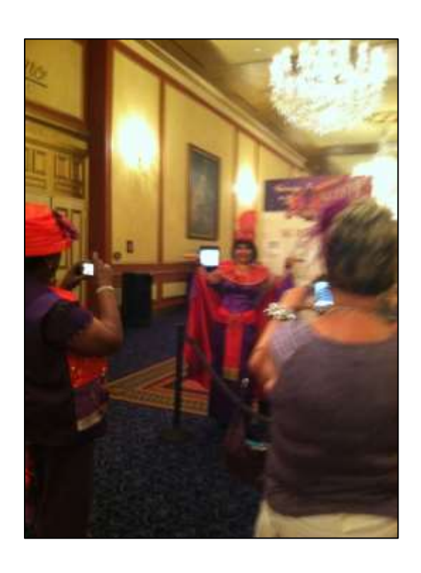
#4, Creativity of seen in RHS Attire