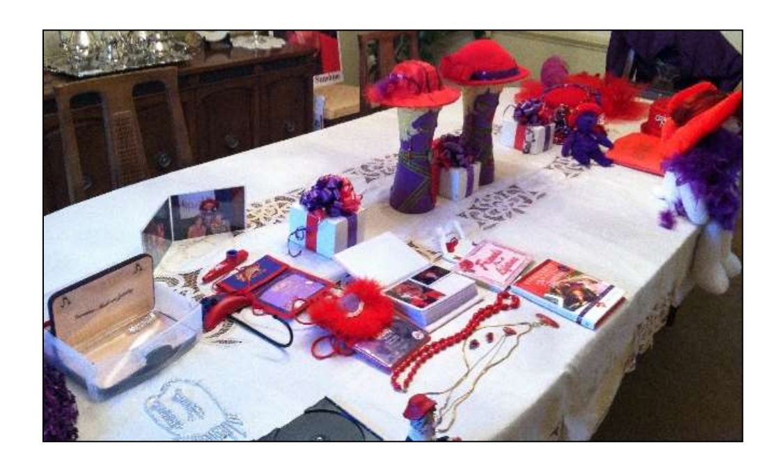
#2, Gersten's note