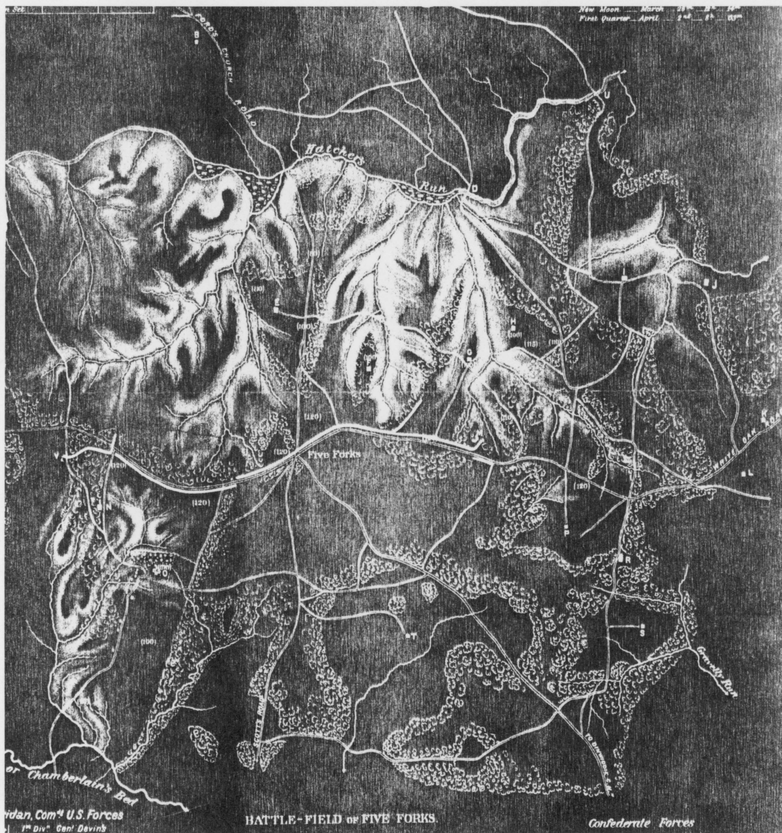
Battlefield of Five Forks, April 1, 1865