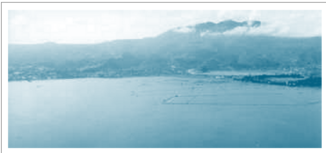
Laguna de Bay