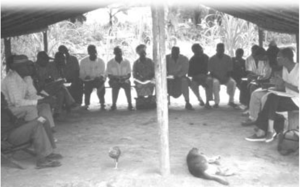
One of the many meetings in Conkouati during the early efforts at establishing a climate of mutual trust and dialogue.

The patrimonial mediation work, essentially a work of conflict management on the basis of the common interests to maintain the local patrimony of natural resources, is long and complex. It is often a case of one step forward and two back. The process begins by identifying all entitled actors, and with them making a preliminary evaluation of the status of the natural resources. Everyone realises that they are all threatened, and that they all wish to maintain the abundance of the natural resources. From there, each group of actors (or ‘stakeholders’) develops a proposition for the management of those resources, basically a voluntary form of zoning, with each zone having different rules of resource protection and /or use. At first, the propositions may seem at odds, but the project staff discusses with the relevant stakeholders the pros and cons of each perspective and develops a compromise solution that is progressively refined and finally accepted by all. A comanagement institution, the Comité de Gestion des Ressources Naturelles de Conkouati (COGEREN) is then formally established. It includes representatives of the local