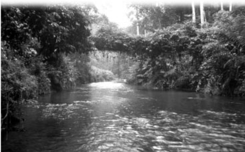
A river path through the forest in Conkouati-Douli National Park.

In November 2002 the newly-elected representatives of the constituencies that compose COGEREN (the mandate of the preceding ones had expired) gathered for a general meeting. They elected a new Steering Committee and a new Arbitration Committee and adopted an action plan dedicated to maintaining the achievement of comanagement in Conkouati, to strengthening their own institutional capacity and to pursuing both the local conservation engagements and some new initiatives to diffuse information and capitalise on the achievements of the past. Hopefully, COGEREN will receive increased support in the future and will be allowed to continue its pioneering work in the country. Ultimately, only a clear national policy in support of participatory management of protected areas will be able to assure its future, but it is significant and highly encouraging that, even in the absence of such