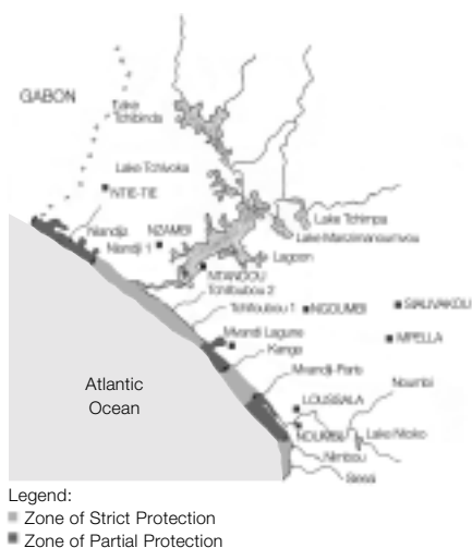
Figure 2. Marine turtle management coastal zoning in Conkouati-Douli National Park. This zoning is the result of negotiations among local communities, Park Management and Forestry Administration.