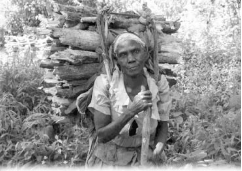
A woman collects firewood in Mt Elgon National Park.

approval by UWA. With this, Mt Elgon National Park will have involved 20% of its surrounding parishes including over 10,000 households in collaborative resource management agreements.