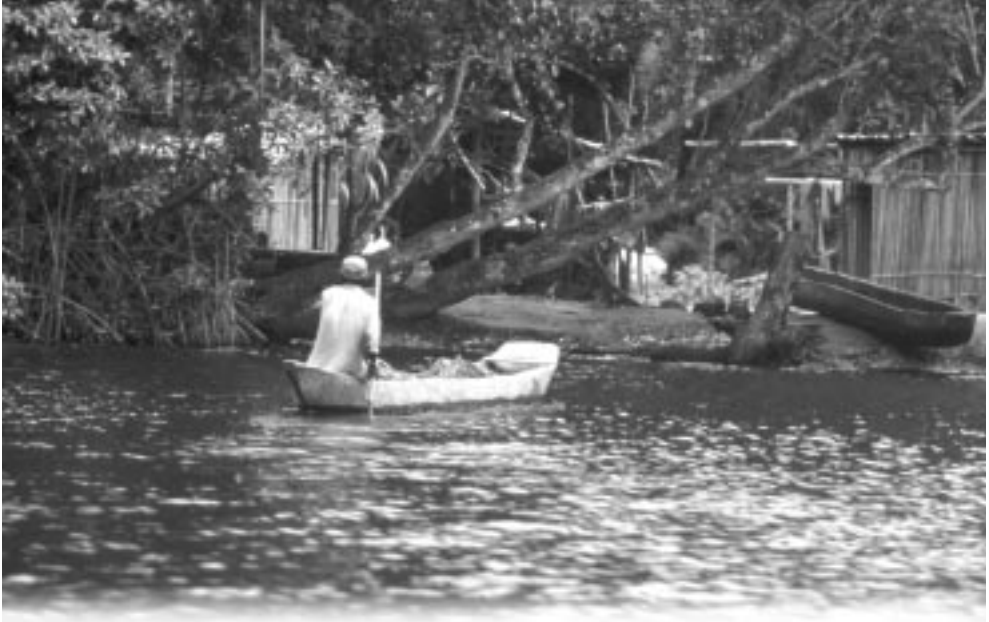
A fisherman returning home to his village inside Conkouati-Douli National Park.

the protected area extremely precarious. In those days, the IUCN project could only ‘hope’ for the engagement of local actors in management. A few years later, the members of the COGEREN and the residents of Conkouati developed a patrimonial vision of their natural resources and began talking about their own comanagement setting with understandable pride – a major achievement.