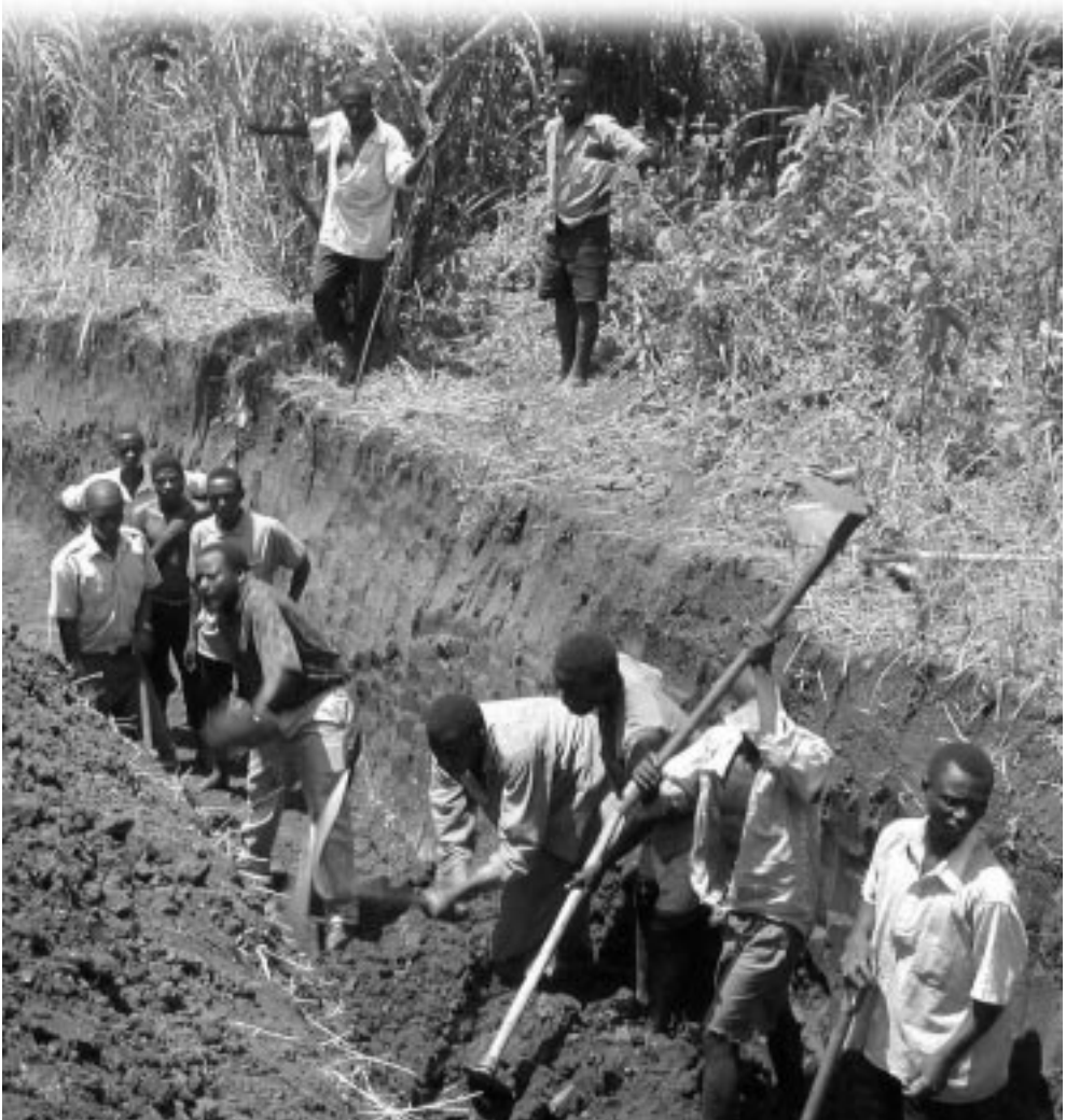
Building an elephant trench outside Kibale National Park.

At Mt Elgon, UWA has entered into partnerships with some five communities adjoining the park to protect and manage the boundary which consists of five lines of Eucalyptus trees planted at 2 m spacing. This is done through formal boundary management agreements that allow people to plant crops under the boundary trees, periodically harvest rows of boundary trees, and manage the coppice re-growth. The agreements have provided an incentive to people to protect the boundary and have brought benefits to both local livelihoods and to conservation.