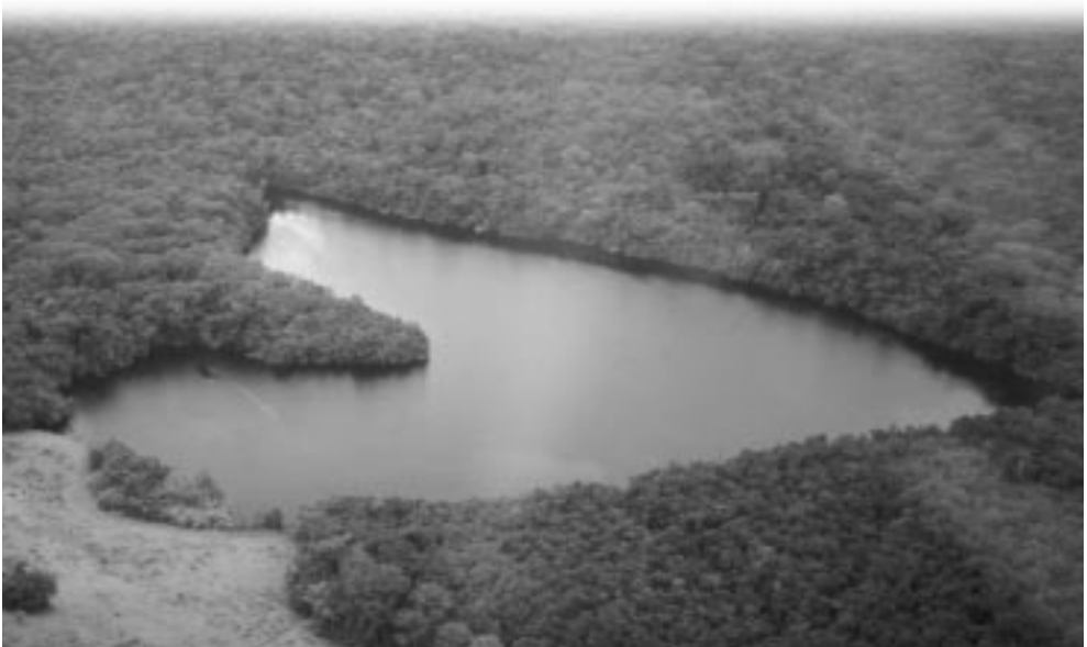
An inner lake of Conkouati-Douli National Park.

The central government is not keen to see any improvement in the situation in Conkouati, basically because it does not wish to offer any help to its political opposition in the area. On the other hand, the local political parties do not have any particular reason to promote the conservation initiative either, as they receive benefits from the already well-established logging companies. The local administration, lacking finances, is at times susceptible to corruption and is certainly envious of the international conservation organisations and their means. Indeed,