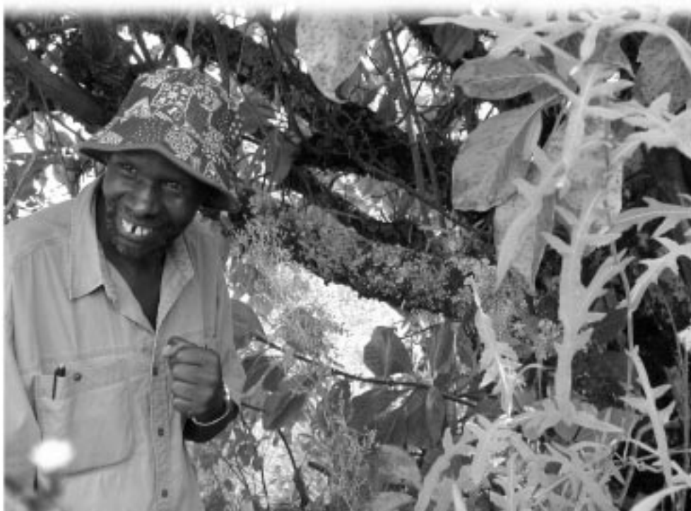
The Chairman of the Resource Use Committee of Kapkwai (Mt Elgon) makes a point about the use of tree bark in traditional medicine.

At Mt Elgon, only about 20% of communities have access to resources through agreements (including those which are now ready for signing). There is a strong demand from the remaining communities to develop agreements quickly so that they too can have access to