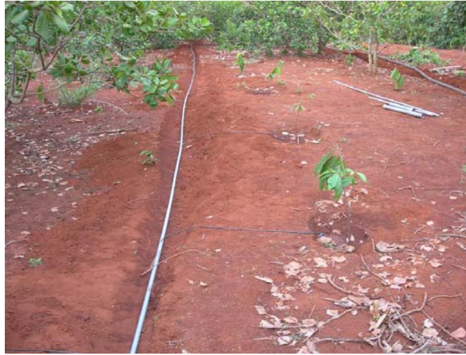
The drip system on 0.5 ha of cashew-cacao is functioning well and ready for use