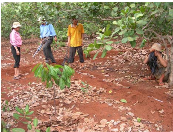
Hand on measuring drip line.