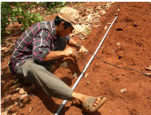
Practicing connecting drip line to the main water line