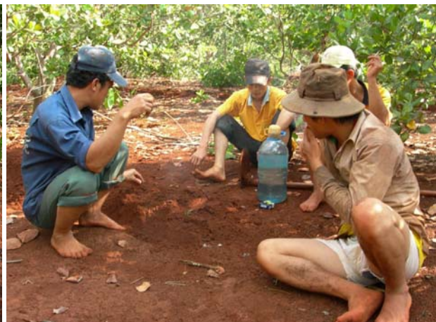
Preparing for the water pipes