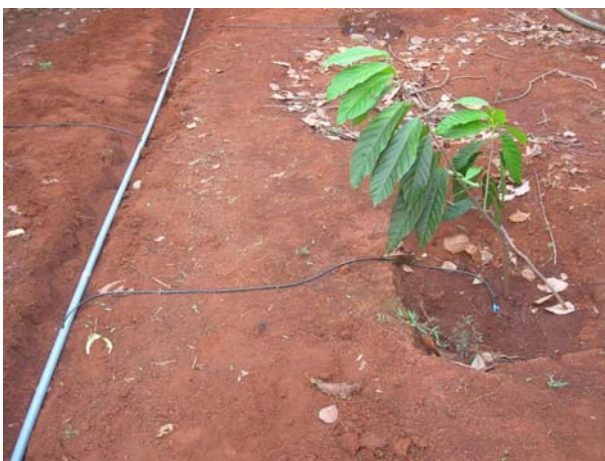
The drip irrigation system is ready to run the first test