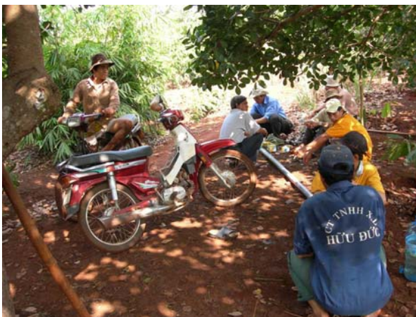
Practicing with the samples

On-field training and participating in set-up a real drip irrigation system: