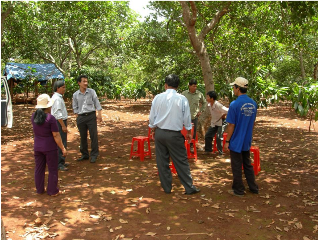
Discussion with farmers on the on-field training and design for the drip system