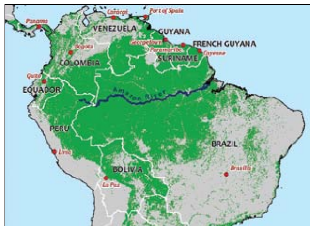
Figure 1: Map of Amazon Basin countries

organised as follows: Section 2 describes the drivers of land-use change and deforestation; Section 3 reviews current PES experiences in the region; and Section 4 comprises concluding remarks.