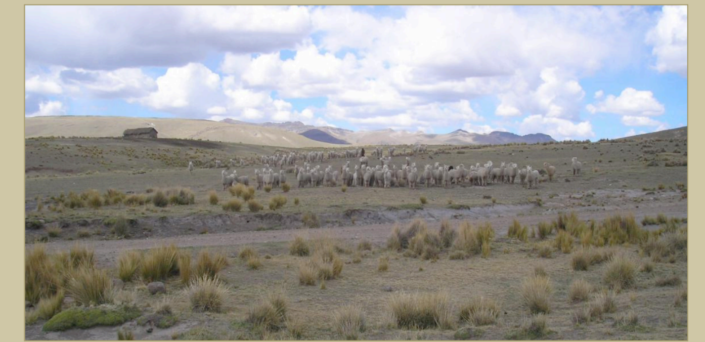
Dry puna zone, Community of Apopata