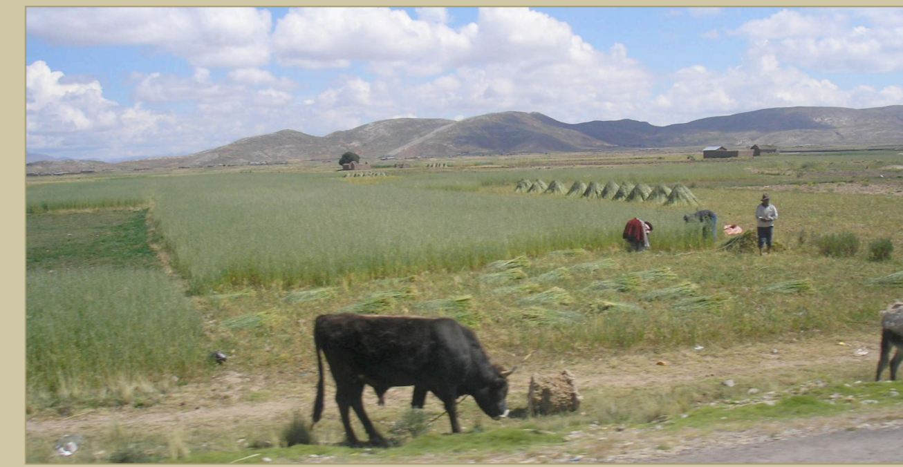
Lakeside zone, Community of Santa Maria