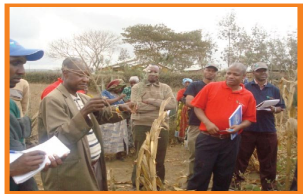
Above: A farmer shows the International Conservation Agriculture Training participants the effect of hard pans on the growth of plants.

Carbon markets are still tiny and depend on domestic policies in Africa, however they have the potential for up-scaling to leverage meaningful private sector investments; it was noted during Agricultural Carbon Project Development Workshop in Kisumu, Kenya. The ACT East and Horn of Africa Sub-Region Coordinator, Dr. Simon Lugandu participated in the workshop whose purpose was to build hands-on capacity on how to develop smallholder agricultural carbon finance projects that can inform respective sector initiatives. The topics covered during the workshop included: Core concepts of climate-smart agriculture; Agricultural mitigation options and related carbon measurement approaches, Carbon project development cycle, Carbon accounting methodologies for Sustainable Agricultural Land Management and step-by-step introduction to developing a carbon project.