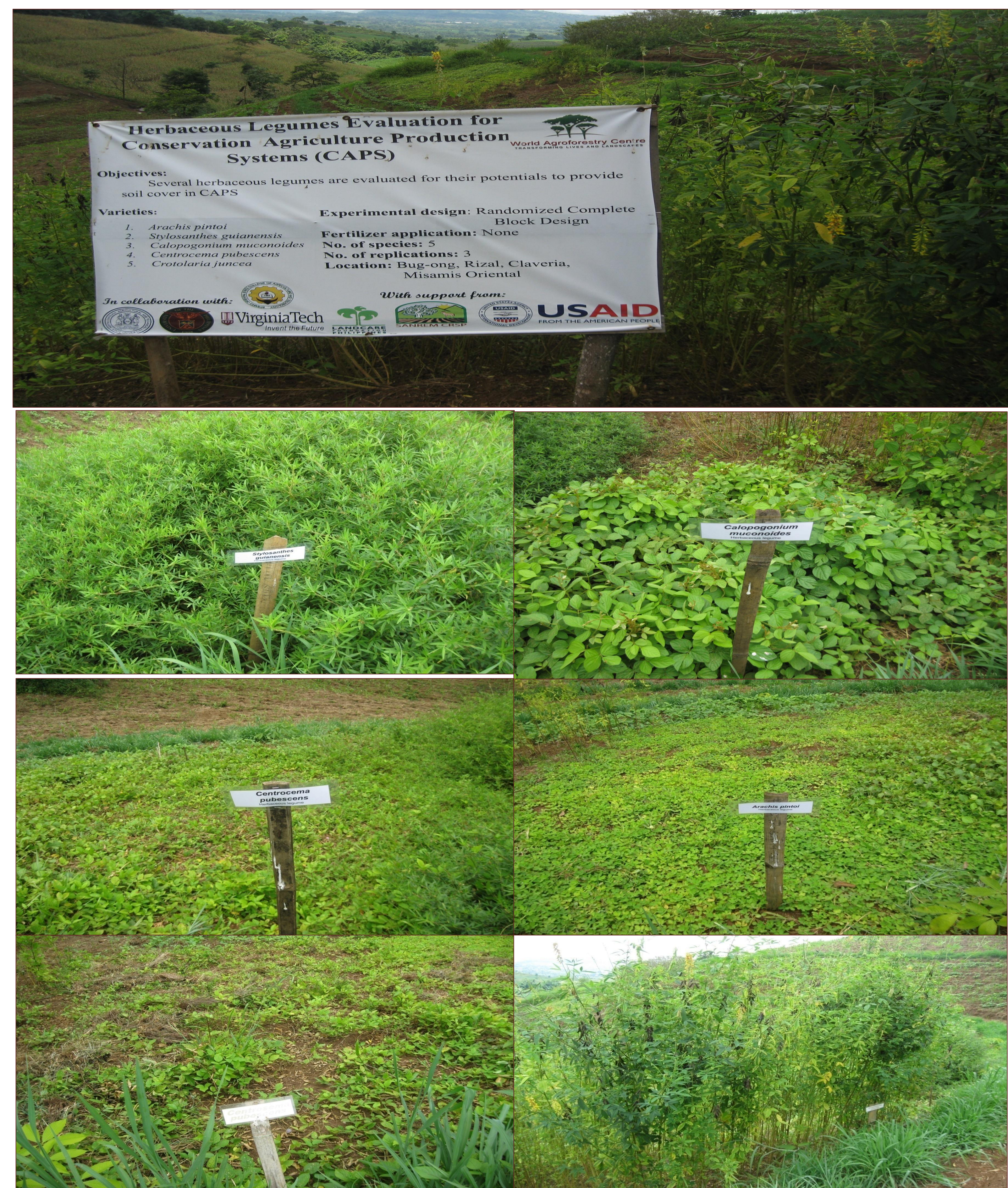
Figure 1. Different photos of forage herbaceous legumes evaluated for CAPS. Claveria, Misamis Oriental, Philippines.

Stylosanthes guianensis and Crotalaria juncea were herbaceous legumes with high in biomass which can be potential inclusion in CAPS providing quality feeds and enhance soil quality through addition of soil organic matter.