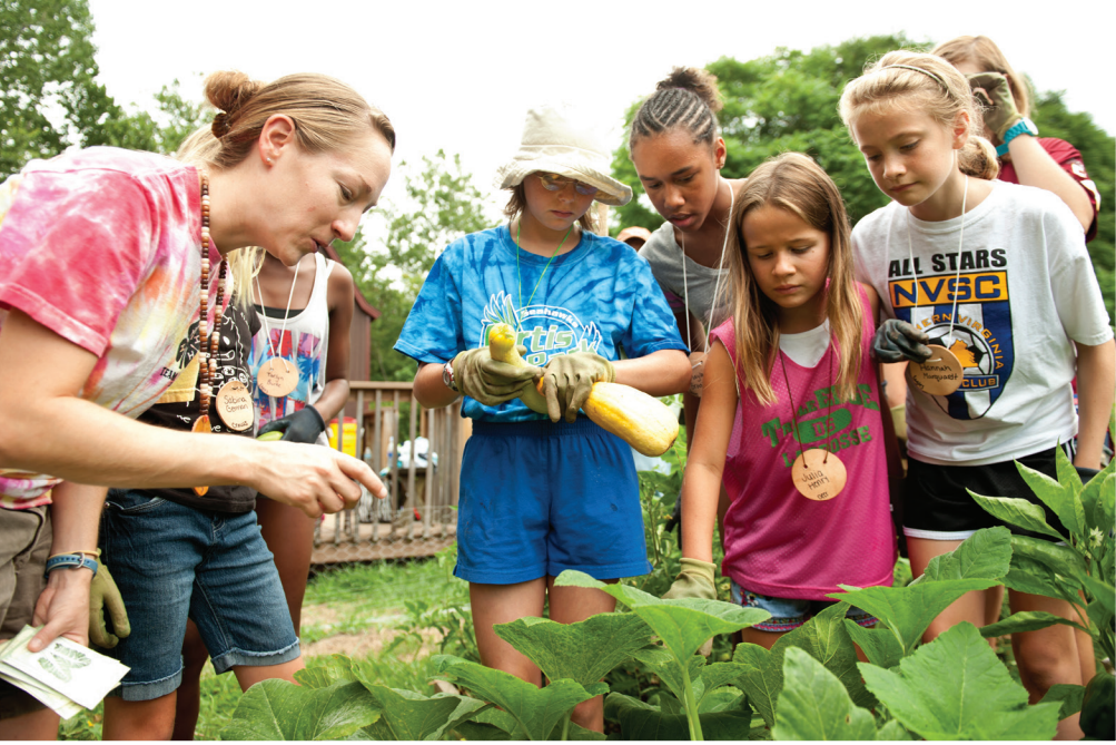
4-Hers at the Northern Virginia 4-H Educational Center learn about gardening, eating locally grown produce, and nutrition as part of camp.