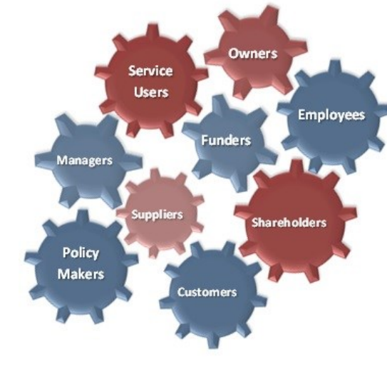
Figure 1.2: Business Stakeholders

Consider your favorite restaurant. It may be an outlet or franchise of a national chain (more on franchises in a later chapter) or a local "mom and pop" without affiliation to a larger entity. Whether national or local, every business has stakeholders – those with a legitimate interest in the success or failure of the business and the policies it adopts. Stakeholders include customers, vendors, employees, landlords, bankers, and others (see Figure 1.2). All have a keen interest in how the business operates, in most cases for obvious reasons. If the business fails, employees will need new jobs, vendors will need new customers, and banks may have to write off loans they made to the business. Stakeholders do not always see things the same way – their interests sometimes conflict with each other. For example, lenders are more likely to appreciate high profit margins that ensure the loans they made will be repaid, while customers would probably appreciate the lowest possible prices. Pleasing stakeholders can be a real balancing act for any company.