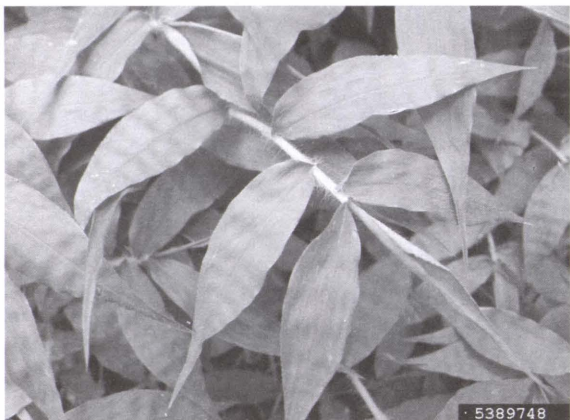
Notice the distinctive pleated waves along the blades of wavyleaf basketgrass.

Regular readers of this column know how much I love the doom and gloom aspect of exotic invasive species; leaving readers with a sense of despair and sadness is my goal. This quarter, however, in anticipation of the soon-to-come warm spring days, I have decided to have a lighter and brighter attitude. In that vein, I'm featuring an exotic invasive species against which we have a chance! Wavyleaf basketgrass (WLBG) is a relatively new invader in the Mid-Atlantic, having first been found near a landfill in Maryland in the late 1990s. The actual method of introduction is a mystery – the horticulture industry does not sell WLBG in the US. Speculation is that WLBG seeds somehow ended up in a discarded hanging basket in the landfill. But no one really knows.