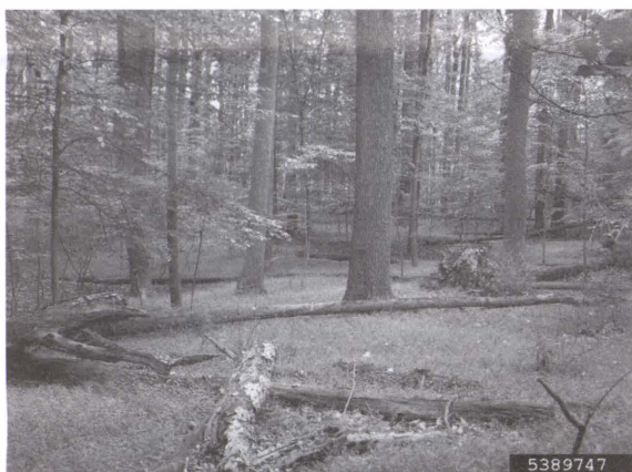
Wavyleaf basketgrass covers the floor of this intact forest.

WLBG is a low-lying, trailing, perennial grass that spreads along stolons (runners) or by seed. The leaf blades are deep green, 0.5 to 1 inch wide, and 1.5 to 4 inches long. The distinguishing characteristic, for which the species is named, is the undulating ripples across the blades. WLBG blooms from mid-August into November. The small purple flowers appear on spikelets (the flowering unit, consisting of two or more flowers) and have glumes (bracts – a specialized leaf at the base of an inflorescence) with very long awns (bristle-like appendages). (That sentence was for the vocabulary lovers out there). The awns produce a sticky substance which allows the seeds to adhere to unwary passersby.