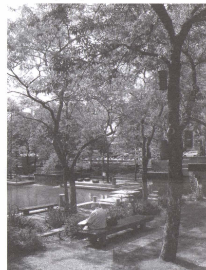
Urban forests bring nature into the built environment, helping create sustainable and viable communities.

And finally, trees keep our towns cool. We all know that under a shade tree is the place to be on a summer day. Just imagine magnifying that effect hundreds of times throughout the community by planting trees. When we do that, we're helping to cut