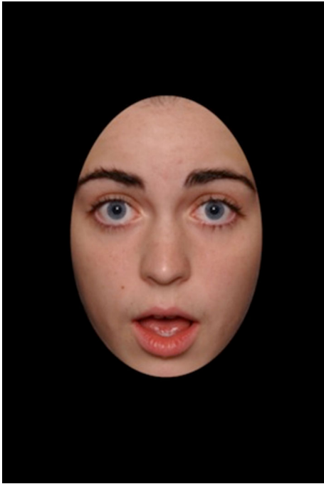
Fig. 1 Sample stimulus depicting fear

Given that adolescents spend much of their time with same-age peers, we examined FER with stimuli designed to specifically portray adolescent faces, addressing one of the major limitations in the current literature—namely a reliance on adult faces. Our stimuli consisted of 257 images of 59 children and adolescents aged 10–17 years (20 males). These images displayed one of five emotions (happiness ( n = 50 ), anger ( n = 52 ), sadness ( n = 48 ), fear ( n = 51 ), and neutral ( n = 56 )) with direct gaze (Egger et al. 2011; Coffman et al. 2015). Figure 1 depicts a sample fear stimulus. All of the images were standardized, such that the faces were approximately the same size and visual properties such as brightness and luminance were controlled for (see Coffman et al. 2015). The total image set was randomly split into 2 separate surveys, in order to keep the surveys brief and to avoid fatigue. The surveys were identical in format and differed only on the specific faces that were portrayed, and, as such, the results for both surveys were combined for analytic purposes. Each participant responded only to one of the surveys.