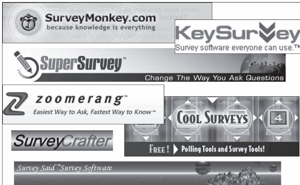
Figure 11.2 Banners for various Internet survey software (accessed January 2007)

There are many ways to draw samples from a population – and there are also many ways that sampling can go awry. We intuitively think of a good sample as one that is representative of the population from which the sample has been drawn. By ‘representative’ we do not necessarily mean the sample matches the population in terms of observable characteristics, but rather that the results from the data we collect from the sample are consistent with the results we would have obtained if we had collected data on the entire population.