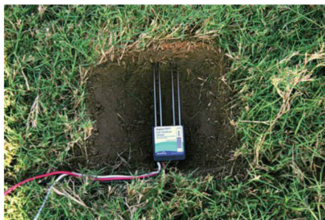
Properly calibrated soil moisture sensors predict the moisture requirements of lawn and landscape plants and are excellent additions to irrigation systems.