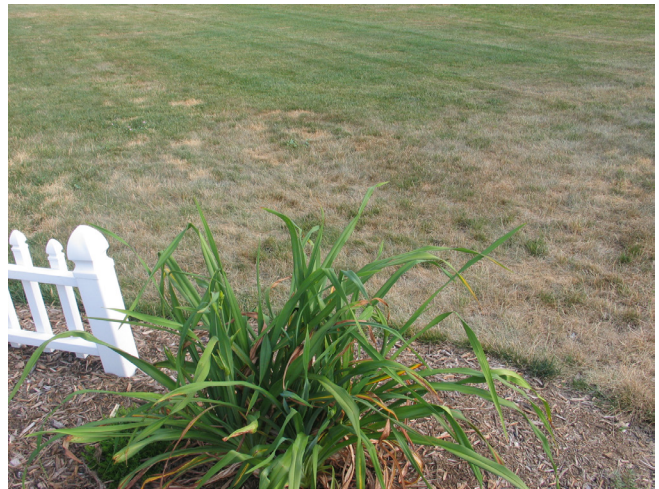
This portion of a Kentucky bluegrass/perennial ryegrass lawn on a very shallow soil has entered summer dormancy due to drought.

During an extreme and persistent drought, it is possible that some cool-season grasses may die and require reseeding in the fall. This may be acceptable to those looking to conserve water during summer months or may be necessary because of water use restrictions during a drought. Again, where warm-season grasses are adapted within the state, consider using them because they can better withstand most drought conditions. Researchers at Virginia Tech continue to evaluate a new generation of “water-saver” grasses, and drought tolerance is part of the selection criteria used in developing the annual Virginia Turfgrass Variety Recommendations list that can be found on the Virginia Cooperative Extension website ( www.pubs.ext.vt.edu ).