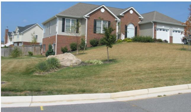
Turfgrasses enter dormancy during severe drought as a survival mechanism.

Overwatered lawns frequently lead to excess blade growth, summer fungal diseases, and more frequent mowing. Excessive watering also wastes water and increases the risk of fertilizer and pesticide runoff from the lawn to paved surfaces. This could negatively impact local water quality. Lawns that receive little to no water from irrigation or rainfall during summer months will go dormant. Grass blade coloring will lighten. Most lawns will recover when water returns.