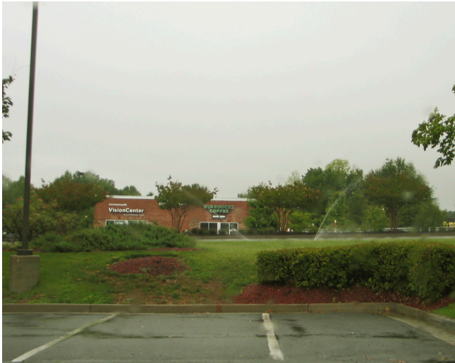
Irrigation during a rainfall event wastes water and suggests the irrigation system and turf are not being properly monitored.

water by rainfall, irrigation may not be needed. Pay attention to current weather conditions and forecasts in order to use water more responsibly. Nothing is more wasteful (and more likely to attract negative attention) than seeing irrigation running in the rain!