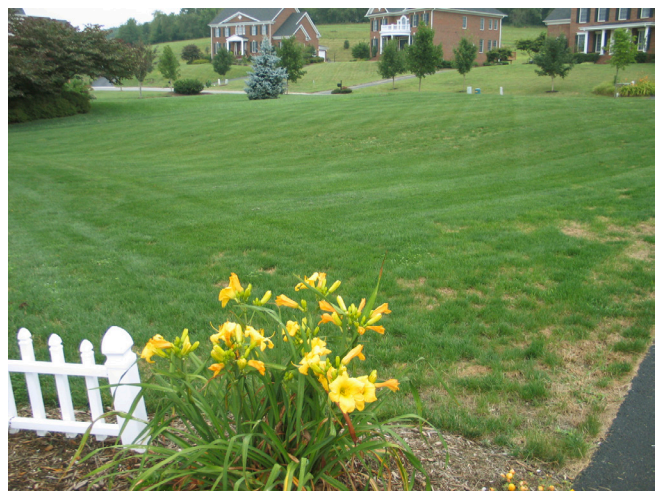
Following one-half inch of rain, there is a dramatic recovery in color and growth of the bluegrass/ryegrass lawn over a one-week period.