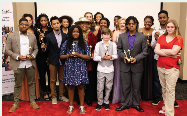
Virginia Youth Voices youth during a Red Carpet Ceremony.

To view some of the work from the 4-H'ers involved with Virginia Youth Voices, visit its Facebook page at https://www.facebook.com/4Hmediamakers .