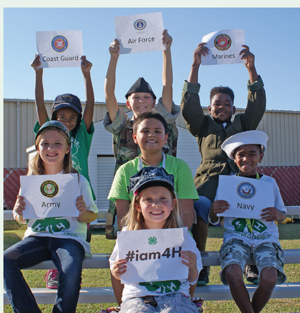
Youth participants of the 4-H Military Program.