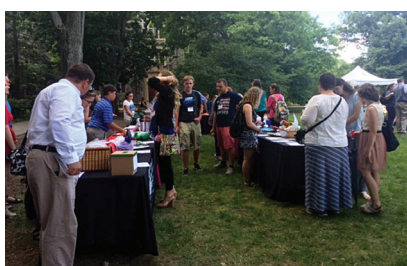
Silent auction held during the 2016 4-H State Congress.