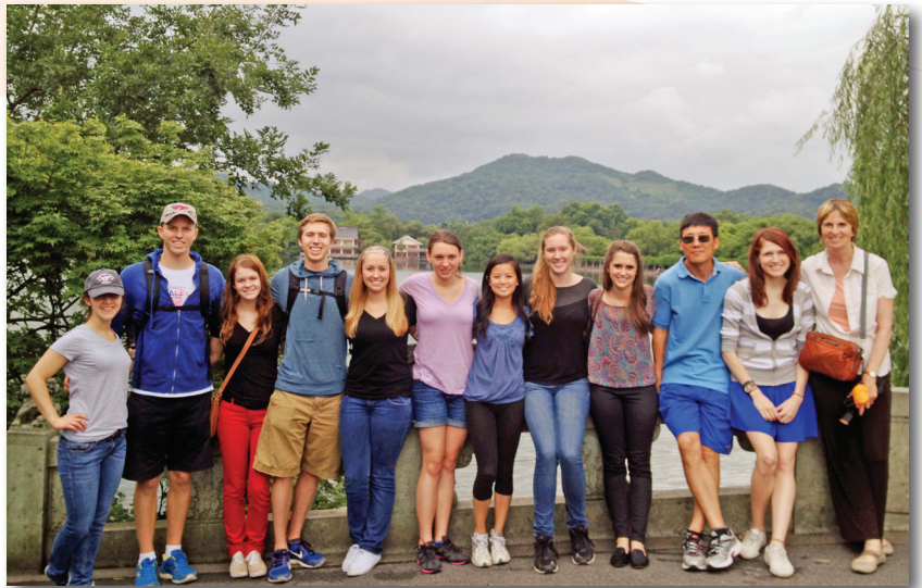
2013 China Summer Abroad students and faculty.

The group also visited the Great Wall, the Temple of Heaven, the Forbidden City, and other famous places.