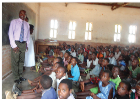
Schools have combined grade levels, are overcrowded, and pupils often sit on the floor.

Because schools lacked running water and toilets, most girls typically stayed home one week every month after puberty. This resulted in getting behind with studies and, combined with the expectation to complete the usual chores, made any academic achievement truly impressive. This was the time most girls gave up and quit, but not Chrissie, who managed to walk 10 miles round-trip – usually on an empty stomach – for the first eight years of her schooling. She was determined to excel, and to keep her resolve strong, she only had to look at the pervasive poverty surrounding her.