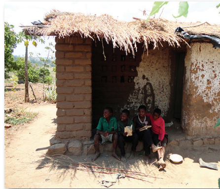
A typical Malawian village house.