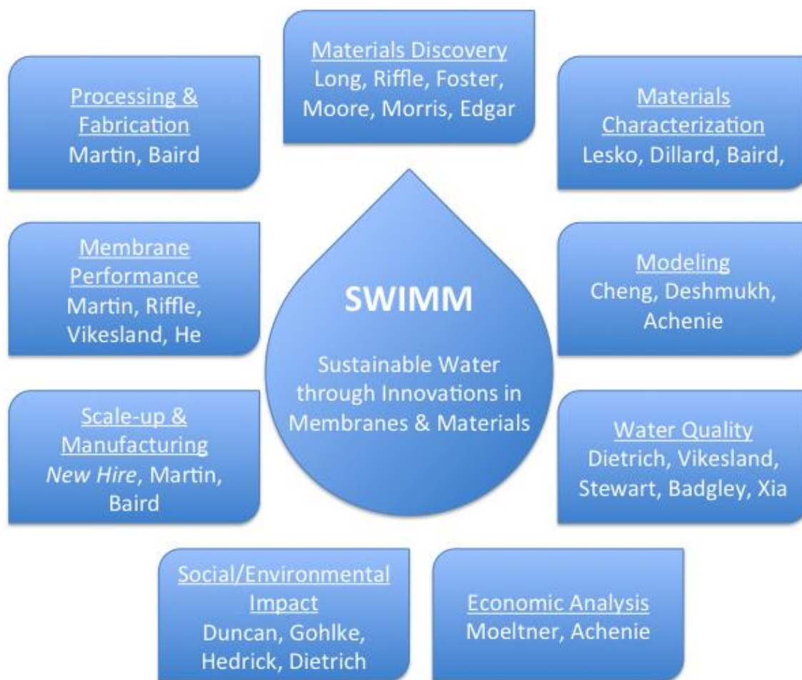
Figure 3: Research Team Contributions