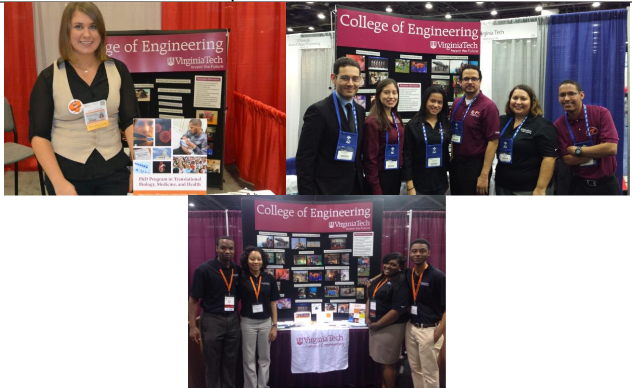
Figure 1: VT students at SWE (upper left), SHPE (upper right) and NSBE (bottom center)

More proactive and less reactive in recruitment: In addition to the activities with the diversity committee representatives from the college went to three career fairs at regional HBCUs (Hampton, North Carolina A&T, and Prarie View A&M). This year a Grad School 101 was piloted at CCAM that involved Hampton U., Virginia State U., and Norfolk State U. Representatives from the College of Engineering leadership and 10 current VT underrepresented graduate students met with prospective engineering grad students from these three universities to discuss how to apply to grad school and what grad school was like at VT. About ~30 prospective grad students attended, all of them underrepresented minorities. The college graduate web page was revamped based on previous data collected. Departments were asked to submit recruitment plans that addressed how they would increase diversity in their graduate programs. The Dean’s Office is leading the multi-year offer process again and leveraging programs such as GEM to attract under-represented groups into the college; 20 offers were made this past fall 2014.