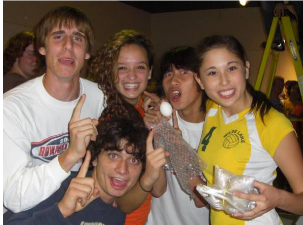
Figure 2: One of the Eek! Don't Let it Leak Challenge Winning Teams.