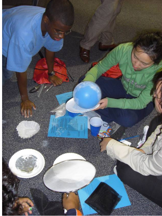
Figure 3: Separate This Challenge