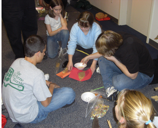
Figure 4: Snap, Krackle & Pop Challenge