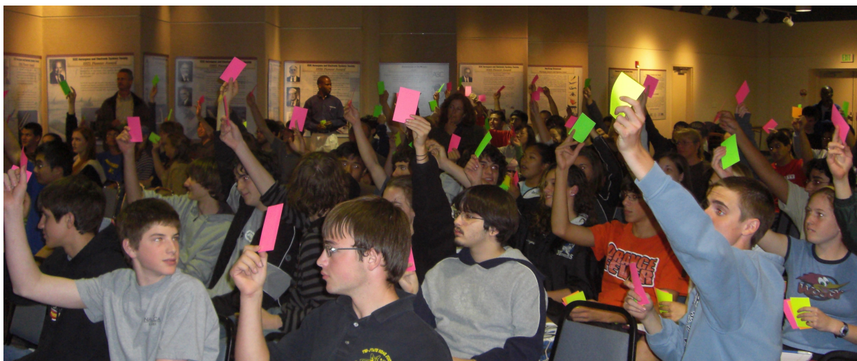
Figure 1: Who Wants To Be An Engineer Activity

Following each presentation, students participated in the popular Who Wants to Be an Engineer game. The game is interactive and required students to match answers to engineering questions by raising color coordinated index cards as the questions were displayed by the projector. Correct answers were rewarded by giving students a “YESS buck” as shown in Figure 1, redeemable for gift cards upon conclusion of the program.