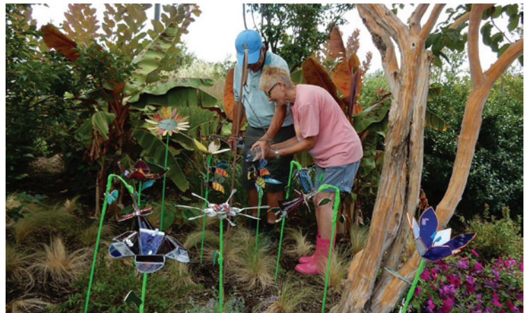
Artists installing their work at the 2016 Simply Elemental Exhibition.

For more information on the Hahn Garden and all the things going on there, please visit our website and be sure to sign up to become a Friend of the Garden: http://www.hort.vt.edu/hhg