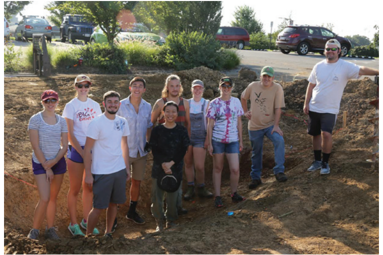
Students working on the rain garden.

The cost of materials for the Entry Garden are paid for by a generous gift from Mike and Pat Hyer. The garden is being built and installed by students in Hardscape Materials & Installation (AT 0174/Hort 3664) and Landscape Contracting Practicum: Rain Gardens (Hort 3584).