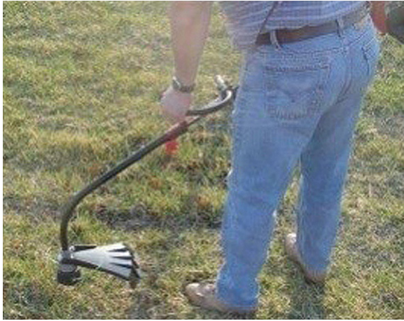
Safe use of a string trimmer.