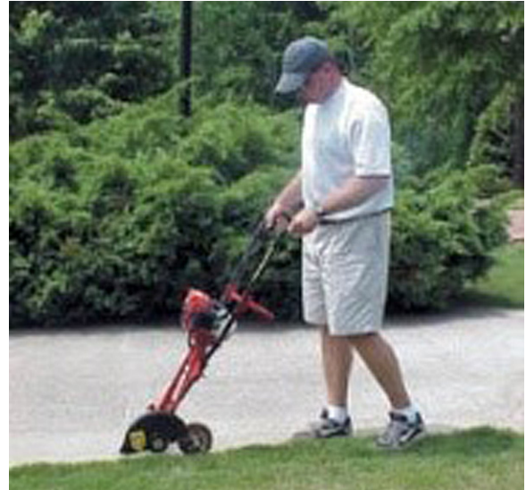
Proper use of a lawn edger.

two-cycle engines and weigh 14 to 25 pounds. Lighter versions (10 to 14 pounds) are now available for non-commercial uses. The larger gas-powered lawn edgers have the capacity to cut a narrow strip between the grass and walkways with the string. Some of these units come with metal bush cutting blades as accessories for cutting small plants. Optional accessories may include blade attachments for other lawn and garden uses.