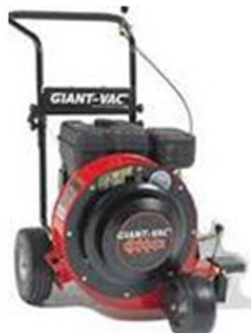
Types of leaf blowers.