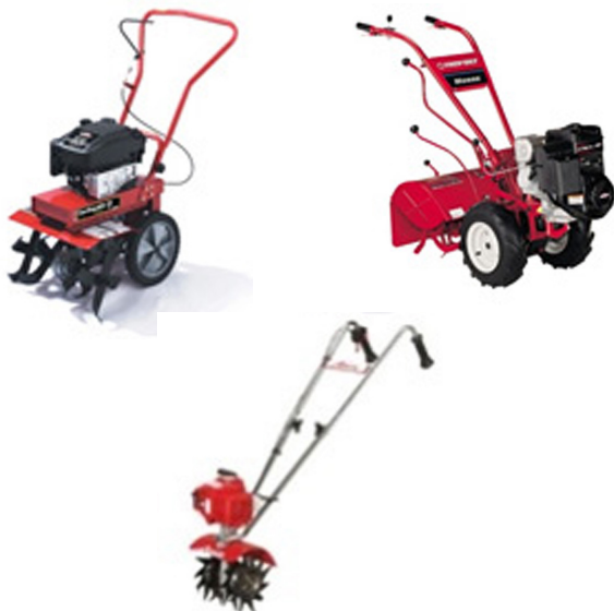
Types of garden tillers.

A garden tiller is a motorized machine that is generally used to loosen and turn the soil with the help of rotating blades. Most garden tillers are powered with small gasoline engines. They are used widely for preparing seedbeds and for cultivation.