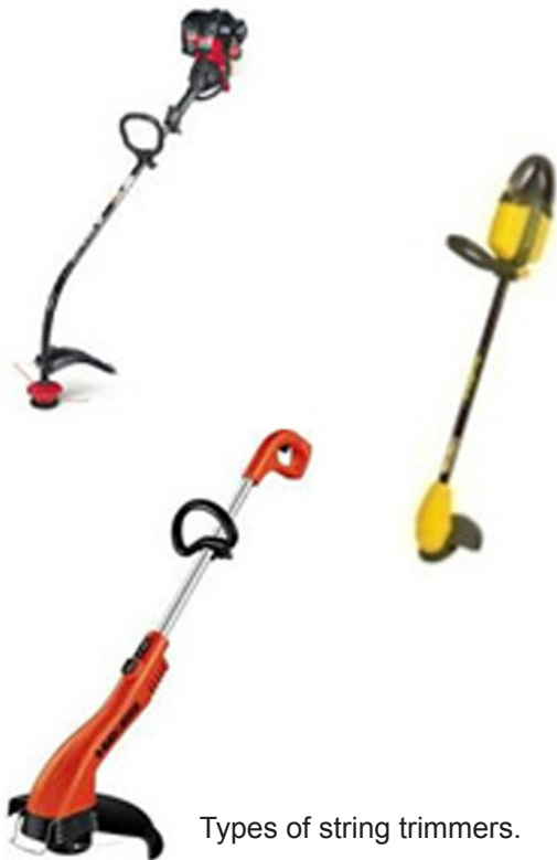
Types of string trimmers.

A string trimmer — also known as a line trimmer, weed whacker, weed whip, or weed eater — is a hand-held device that uses a flexible monofilament line for cutting grass and similar plants around stationary objects. It consists of a cutting head on one end of a long shaft and a handle or handles on the other. Sometimes these trimmers come with a shoulder strap. They are usually powered by either an internal combustion engine or an electric motor.