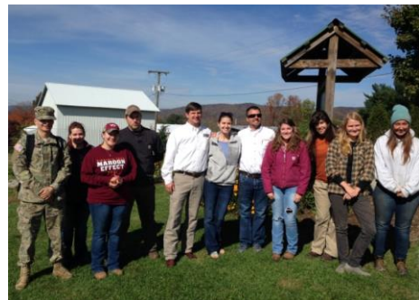
Group photo of the Career Practicum class with Horticulture Alumni