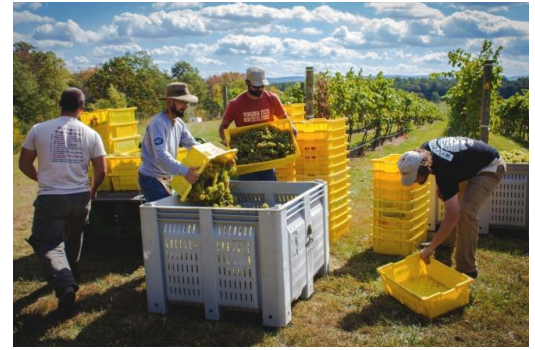
Grape harvest at Alson H. Smith, Jr. AREC