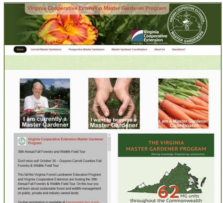
Home page of the new and improved Master Gardener website

In September, the VCE Master Gardener Program unveiled a new website with improved features and an updated look. Users can connect and stay updated with VCE Master Gardener Facebook posts through the live feed displayed on the home page. Through a password-protected area, coordinators can access resources, including certificate requests, downloadable marketing tools/templates, and social media guidelines. Some familiar features have been retained, such as Master Gardener College news, Coordinator Endowment updates, and local unit contact information. Past and current editions of the "In Season" newsletter will still be available to users through the site. We intend for the website to be visually engaging while providing users with a more seamless navigation through content.