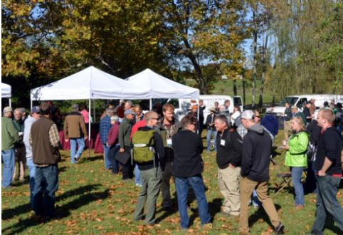
Conference participants during the field day